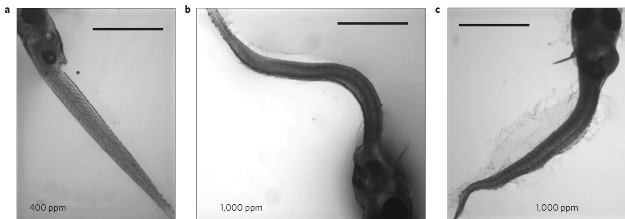
Figure 3 | M. beryllina larvae exposed to normal and elevated levels of CO 2 . a–c , Larvae with curved or curled bodies were significantly more common at increased ( b,c ) when compared with control ( a ) CO 2 levels. Scale bar = 1 mm.

expect, however, in a manner similar to what is now emerging from studies on invertebrates 1,3–5 , that responses to increased CO 2 levels in fish will be highly species specific. For example, oceanic fish species that spawn pelagic eggs might be more susceptible to CO 2 increases than benthic spawners 22 , where eggs may be more adapted to natural CO 2 fluctuations due to elevated rates of microbial respiration.