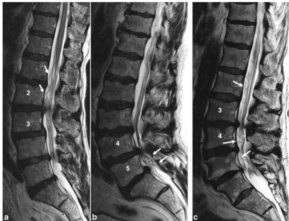
Fig. 3 a Sagittal T2WI with RNRs cranial, b caudal, and c cranial-caudal from the KSL. The ASED notation would be as follows: a RNR+: L2/L3.S.1+.cr; b RNR+: L4/L5.L.1.ca; and c RNR+: L3/L4.L.1+.cc

Three senior raters (one neuroradiologist, one orthopedic surgeon, and one neurosurgeon with 15, 10, and 35 years of experience, respectively) and three junior raters (orthopedic surgeons in training) independently classified all RNRs on the MRIs.