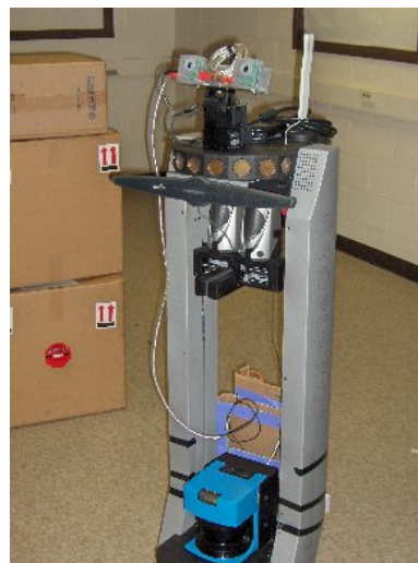
Fig. 3. The robot used for the experimental evaluation.

The task chosen for the evaluation takes place against the backdrop of a hypothetical space scenario [17]. A mixed human-robot team on a remote planet needs to determine the best location in the vicinity of the base station for transmitting information to the orbiting space craft. Unfortunately, the electromagnetic field of the planet interferes with the transmitted signal and, moreover, the interference changes over time. The goal of the team is to find an appropriate position as quickly as possible from which the data can be transmitted. The robot is dependent on its human teammate for direction, supplied through natural language commands, while the human is dependent on his robotic teammate for "field strength" readings that cannot be obtained through other means. The specific goal of the team is to find a viable