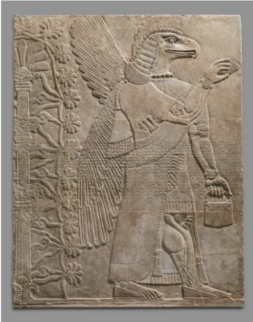
Figure 2.1. Bird-headed Genie with Multiple Wings. Metropolitan Museum 31.72.3.