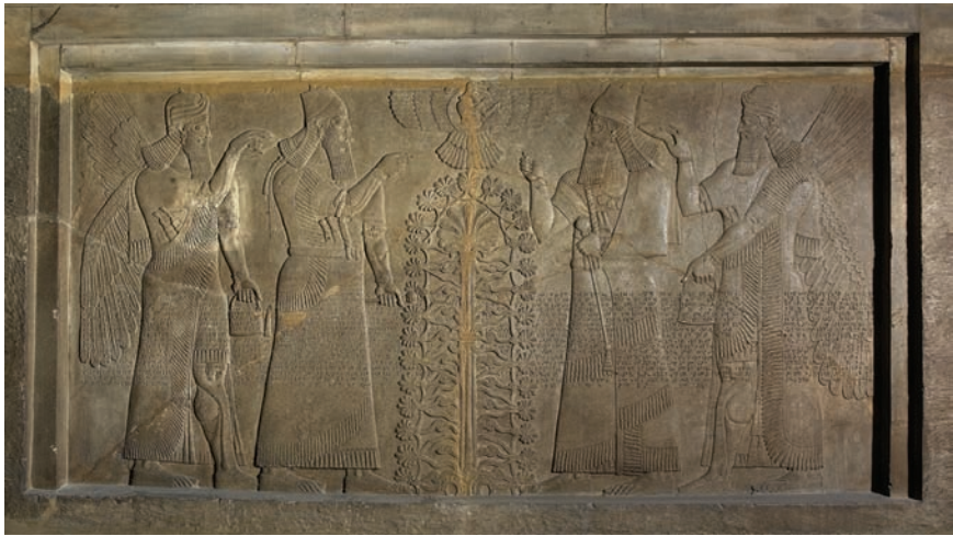
Figure 2.5. Pivot Relief. BM 124531.

therefore call attention to) the sacred tree motif in some reliefs and to the throne in the throne room.