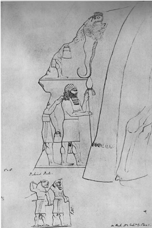
Figure 2.4. Winged Snake, from the Southwest Palace. Reproduced from Barnett and Falkner, The Sculptures of Assur-nasir-apli II (883-859 B.C.) , 164, plate CXII.