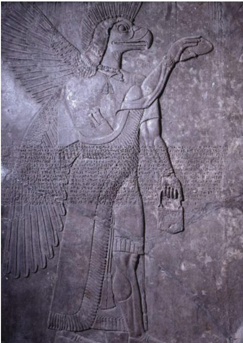
Figure 2.2. Bird-headed Genie with Multiple Wings. BM 98064.