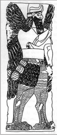
Figure 2.3. Scorpion Man, Limestone Relief from the Northwest Palace at Nimrud. Reproduced from Huxley, "The Gates and Guardians in Sennacherib's Addition to the Temple of Assur." fig. 7.