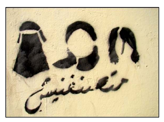
Figure 12. Don't label me graffiti

One of the most brilliant graffiti of the "Noon El Neswa" organization is the one on which was written "Don't label me". The secret of its brilliance is that it touches upon a taboo in Egypt which caused a kind of negative discrimination between the girl who wears a veil and the girl who doesn't wear it, as if the one who puts it is a decent girl, while the one who doesn't is an indecent one. Not to mention that the girl or woman who puts the face burqaa is considered by others as an extremist. This graffiti calls for stopping this kind of pre-judging people especially women based on their costume, which is from the researcher's point of view, very important to talk about visually (Figure 12).