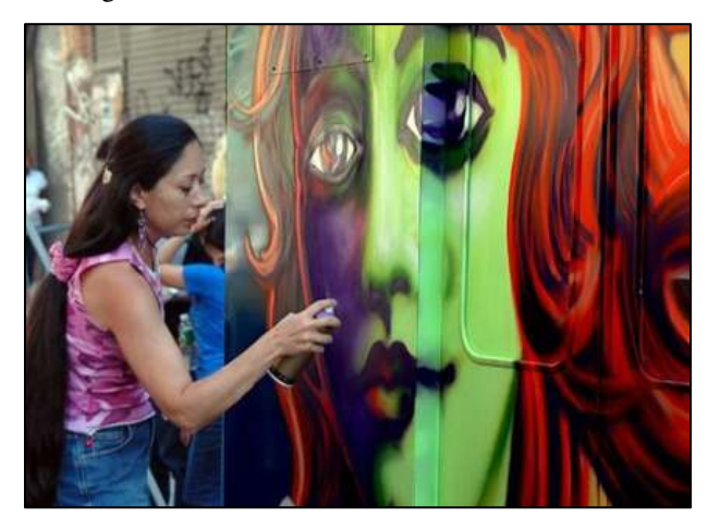
Figure 1. Lady Pink, Graffiti artist.

Not too far from the previously talked about history of the feminist art movement, actually, within the 2<sup>nd</sup> feminist wave, in the late 1970s, Sandra Fabara or as known Lady Pink or "first lady of graffiti" originally from Ecuador, has been known as one of the first graffiti and mural female artist based in New York City, (figure1).