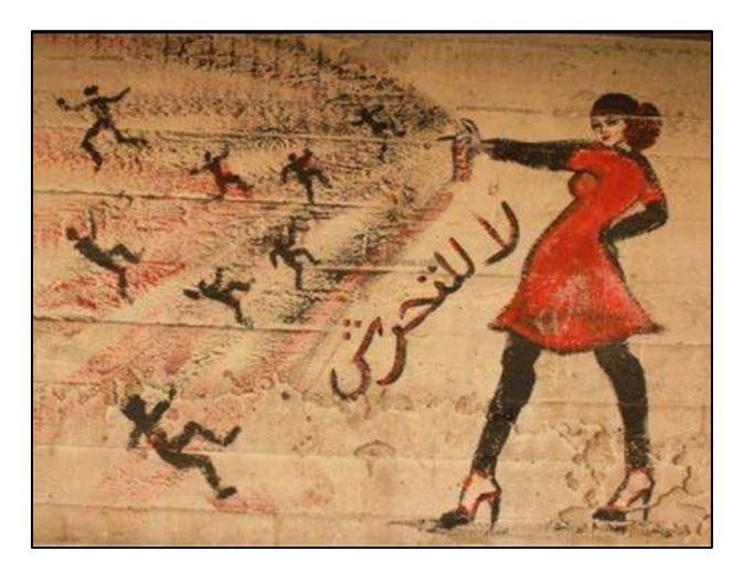
Figure 7. "Nefertiti" by El-Zeft Cairo, 2012