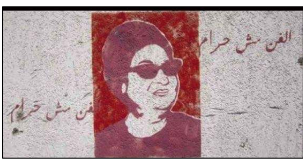
Figure 9. Art is not forbidden