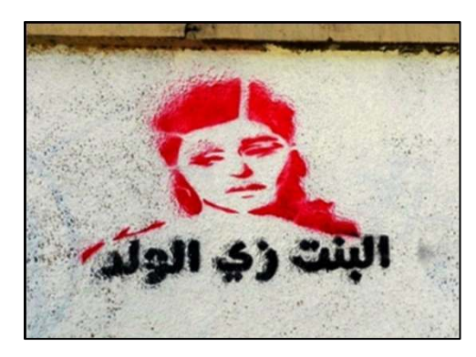
Figure 10. Long live Free Egypt