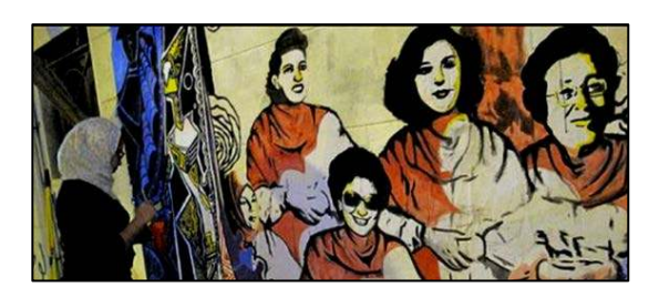
Figure 13&14. Mural paintings executed within the activity of the "Lady of the Wall" project.