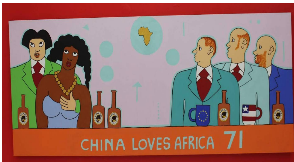
Painting '2' is Michael Soi China Loves Africa painting no. 71, Acrylic on canvas, 100 x 244.5 cm

'Chairman' placed in front of the Chinese. This addition suggests that he supposedly holds the economic and political control of some Africa countries because he bankrolls their growing infrastructural development and they are in massive debt. Creative sublime essence is in the satire that is subsumed in the lettering 'Chairman' and the designation of the Chinese as such. First, it is literally improbable that a Chinese (China) will be the Chairman of African Union. However, the metaphorical supposition is that Soi's reading and consequent interpretive outcome of the Sino-Africa trade relations, propels him to postulates that by 2030 satirically though, that China will very likely be in control of Africa's major political and economic decision making. Soi is effectively applying the paintings as efficacious visual narratives to raise an alarm, in what some scholars rightly or wrongly tagged neo-colonial potentialities (see Alden 2007; Brautigam 2009; Lumumba-Kasongo 2011; Chen 2016; Okolo & Akwu 2016; Langan 2017; Swedlund 2017). This is because Soi projects that since some African countries are rapidly getting heavily indebted to China, these African countries will have no choice but to resign to the dictates of China.