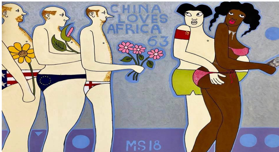
Painting '3' is Michael Soi's China loves Africa paintings no.63, Acrylics mixed media on canvas 200 by 140 cm added to Michael Soi studio's Facebook page on 7 th March 2018

USA and Africa, and between the other Corsican countries and Africa. On the other side which is significantly distant from the entangled Chinese (China) and Africa (the dark brown skin woman) are the three Corsicans who are also interested in the woman (Africa) but are far from possible control or takeover, because the Chinese appears to be in firm control. In addition, the facial expressions of the Corsicans project consternation to say the least, which is similar to their facial expression in painting '3' below. In support of this position, Lawal Mohammed Marafa observes that, "China is forging deep economic relationships with most African countries with the aim of securing access to their vast natural resources" (2009: 19). Furthering, he notes that, "there already exist political and military ties dating back over 50 years" and "to date, China is moving ahead with strategies that appear to have worked in its favour as a result of the neglect by traditional Western allies" (2009: 19). In addition, Marafa opines that the apparent vacuum created by the exit of West, arguably did provide the opportunity for China. For instance, "when the US evacuated its citizens in the wake of the outbreak of the Ethiopian war with Eritrea in the 1990s, China saw the reduced presence of the US as an opportunity" and China "strategically moved in with aid, grants, loans and projects" (2009: 19).