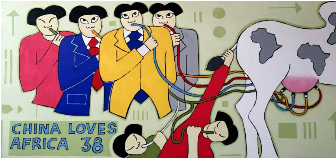
Painting '6' Michael Soi's China Loves Africa painting series no. 38, acrylics mixed media on canvas 200 by 100 cm, added to Michael Soi studio's Facebook page on 30 th April 2015