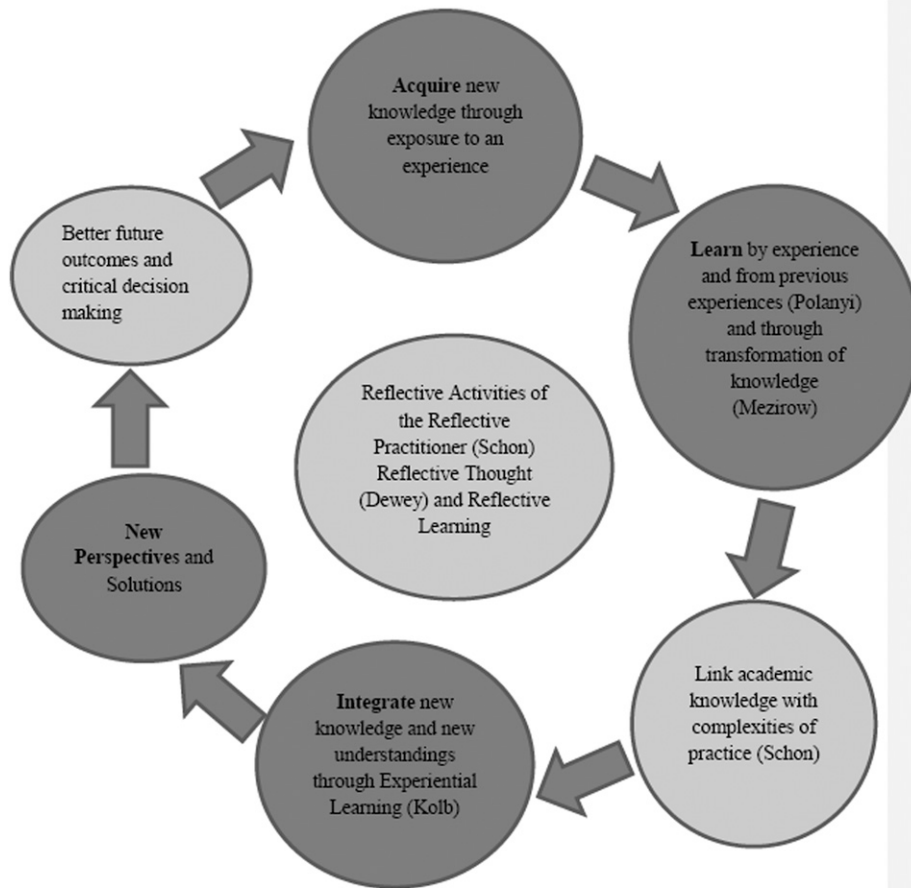
Figure 2. Reflective Concepts framework: acquire, learn, integrate, new perspectives.

Three main processes – acquire, learn, and integrate – can be drawn from the theories of these early educators: (1) acquire new knowledge as a direct result of learning from experience; (2) learn from experience by transformation of