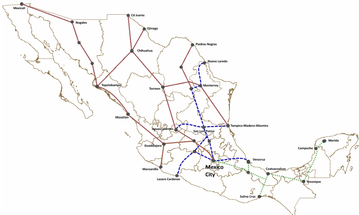
Fig. 2. Geographic competition: the restructured Mexican railways

As the railways reform debate has progressed and different options have been pursued in different countries, there come to be greater appreciation of the possibility that different reform strategies might be appropriate in different countries and environments. There has in many cases also come to be a differentiation in the strategic options pursued for freight and passenger operations [27].