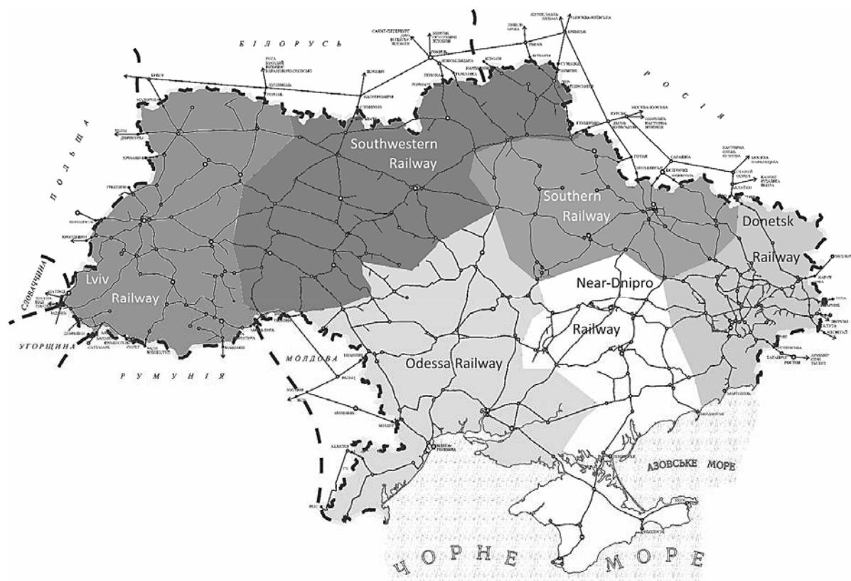
Fig. 1. Six Ukrainian Railways

The World Experience with Railways Restructuring. The decades of the 1990's and the 2000's were everywhere periods of neoliberal reform and privatization strategies in general and in the railways sector in particular [19]. As in other infrastructure sectors, railways reforms around the world have tended to focus both on the introduction of private-sector participation and on the possibilities for the creation of competition in the context of what has been traditionally considered a natural monopoly. Also as in other infrastructure sectors, economists around the world have tended to favor the structural separation of going concerns as a sort of default option – as the generally preferred method of restructuring to create competition among users of a network. It has only been recently that much scholarly attention has been paid to the potentially negative cost implications of this policy in industries as diverse as railways, electricity, telecommunications, and water [40, 41, 46, 55].