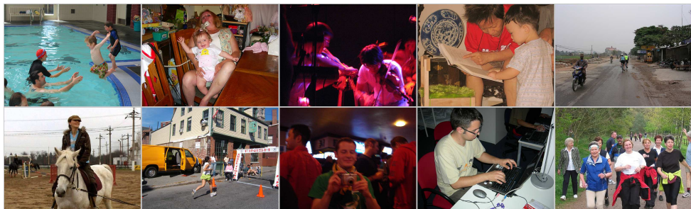
Figure 2: Random images from VOC2012 Action Dataset. From left to right and top to bottom, the classes are: jumping, phoning, playing instrument, reading, riding bike, riding horse, running, taking photo, using computer, and walking.