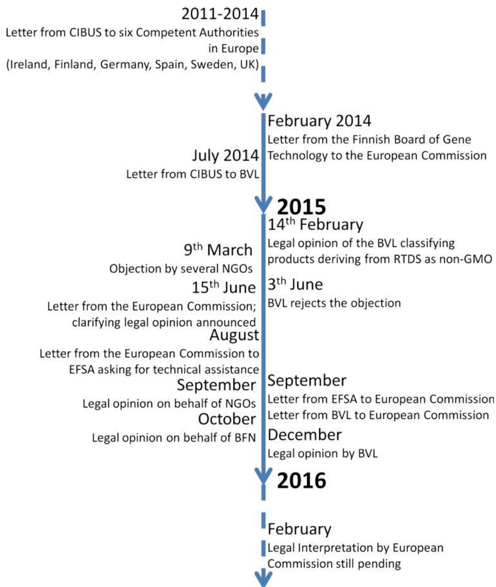
Fig. 1 Timeline of the debate on the legal interpretation of genome editing techniques and resulting crops in the European Union

Several NGOs released a legal analysis in September 2015, in opposition to the BVL notification, claiming that the Directive 2001/18/EC was misinterpreted and that all NPBTs (including ODM) should fall under the scope of GMO regulation as the analysis comes to the interpretation that the European gene technology law is strictly process-based (Krämer 2015; Table 1). A second legal analysis on behalf of the German Federal Agency for Nature Conservation (BFN) assisted these opinions. Besides providing the same legal interpretation, it additionally includes RdDM as a genetic engineering technique (Spranger 2015; Table 1). Both legal analyses interpret the Directive 2001/18/EC as strictly process-based and state that all NPBTs make use of recombinant DNA and thus have to be regulated as GMOs, regardless of whether a