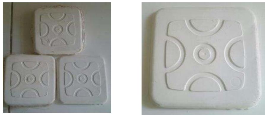
Fig. 7. Experimental products