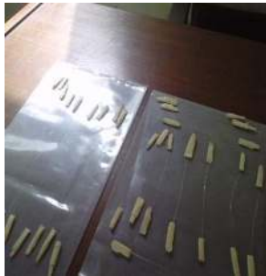
Fig. 4. Fiber sampling