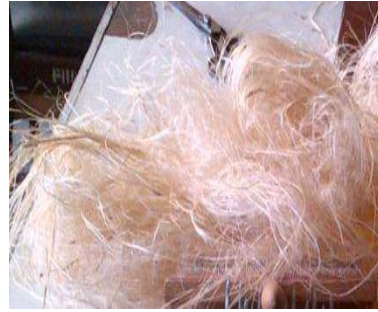
Fig. 3. Extracted and modified kenaf blast fiber