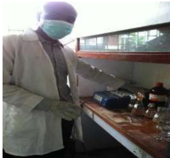
Fig. 5. Chemical modification