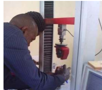
Fig. 6. Mechanical testing (Tensile strength)