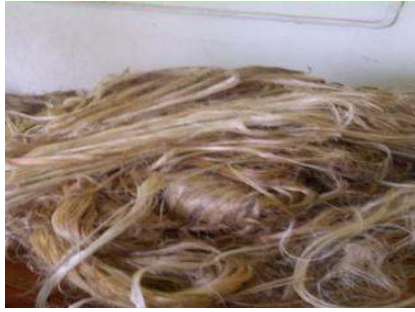
Fig. 2. Extracted kenaf blast fiber