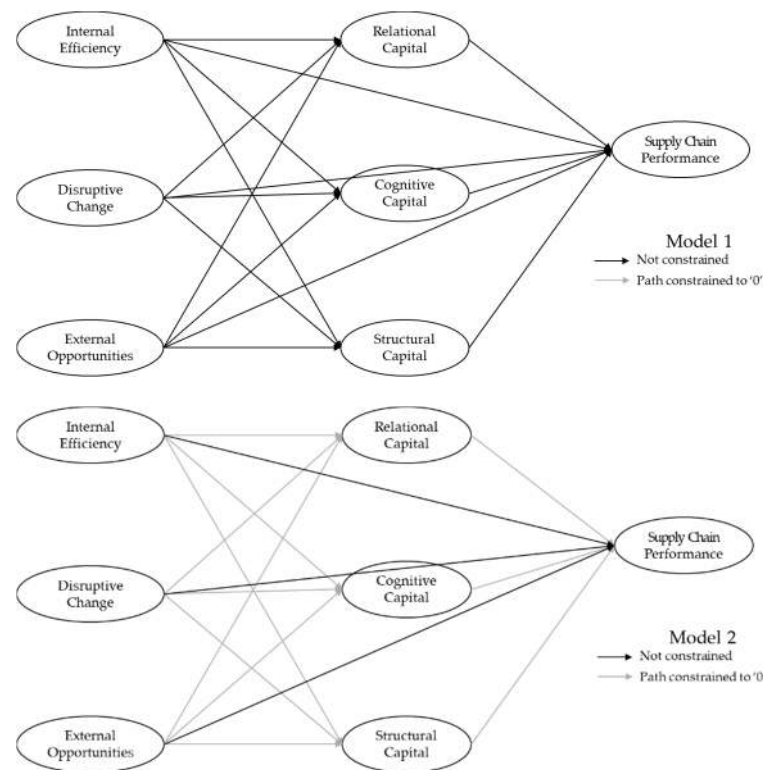
Figure 3. Alternative models to verify the mediating effect (Model 1 and Model 2).

the direct effect of digitalization on supply chain performance was small and a relatively large part was mediated by social capital, supporting H3.