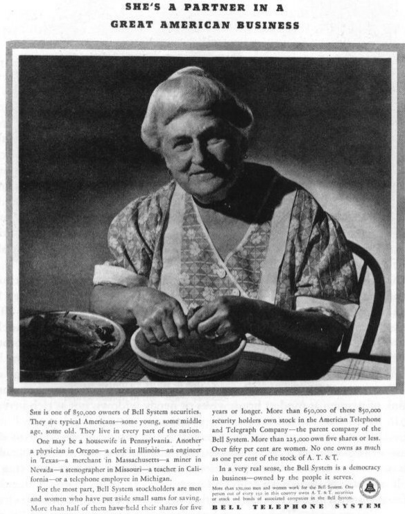
Figure 2. An ad in the campaign by Bell Telephone System to humanize the corporation.

Fairness has been the focus of a growing literature in economics. Our paper's contribution is to lay out a simple framework to discuss how such considerations may help understand better the benefits of regulating monopolies. Specifically, we show how anger and competition are connected and how the anger/fairness objective modifies the simple Kaldor-Hicks criteria (based only on efficiency considerations) yielding three channels through which monopolies affect welfare. The framework can also be applied to help explain the choice between different regulatory approaches, such as anti-trust versus regulatory agencies or between regulatory instruments, such as fines versus price regulation.