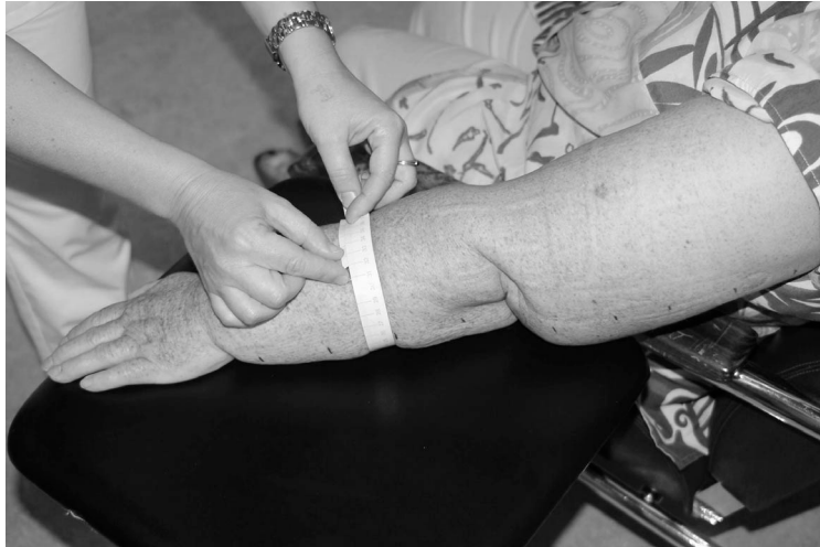
Fig. 1. Circumferential measurement of the upper limb.