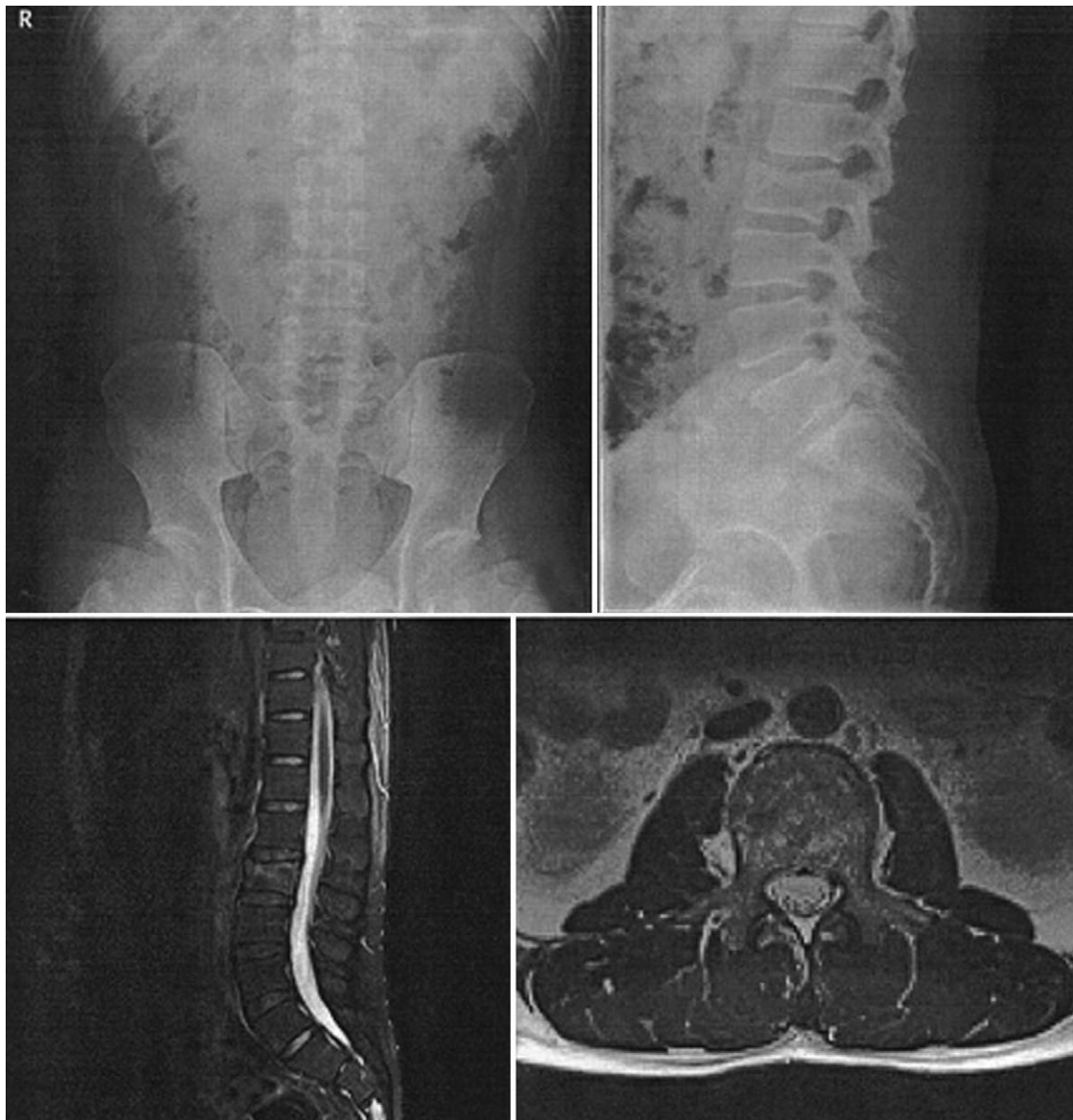
Fig. 1. A neurologically intact patient (0 point) with compression fracture (1 point) and intact posterior ligamentous complex (0 point). Total score was 1, thus treatment recommendation is non-surgical treatment.

Afterward, the intrarater reliability, as well as the interrater reliability of the score for each variable and sum, were evaluated by Cohen's unweighted k -value and Spearman's rank order correlation. For the statistical distinction of the Kappa values, the distinction according to the guideline of Viera and Garrett [13] was applied (Table 3). In addition, the sensitivity and specificity were evaluated by the percent of correct treatment protocols according to the sum of the TLICS and the treatment actually performed on the patients. The validity of selecting treatment protocols according to this classification was also assessed. SPSS ver. 13.0 (SPSS