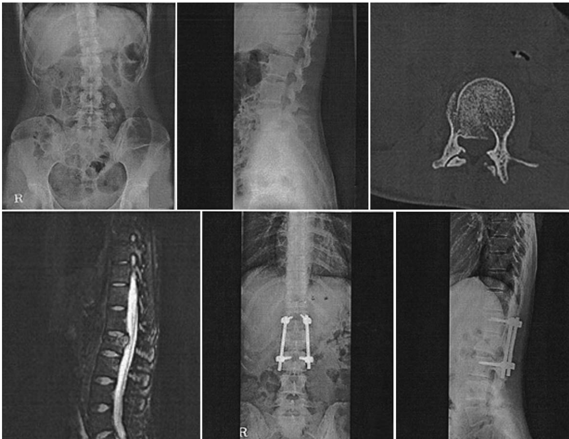
Fig. 3. A neurologically intact patient (0 point) with compression injury of L2 vertebral body (1 point) with burst component (1 point) and intact posterior ligamentous complex (0 point). Total score was 2, thus treatment recommendation is non-surgical treatment. But, about 40% canal compromise with kyphotic deformity was seen and we treated this patient with surgery.

Vaccaro et al. [22] in 2005 suggested a new classification method, the Thoracolumbar Injury Severity Score (TLISS) and this would compensate for the problems of the previous classification systems and satisfy the requirements of an ideal classification system. This classification scores three variables that are considered to be directly associated with the stability of the vertebral body and the prognosis. These variables are composed of the mechanism of injury as deter-