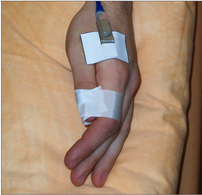
Figure 1. Positioning of the micro-lightguide spectrophotometry probe LF 2 (LEA Medizintechnik, Giessen, Germany) for the measurement of laser Doppler flux and tissue oxygenation at the thenar eminence of the hand.