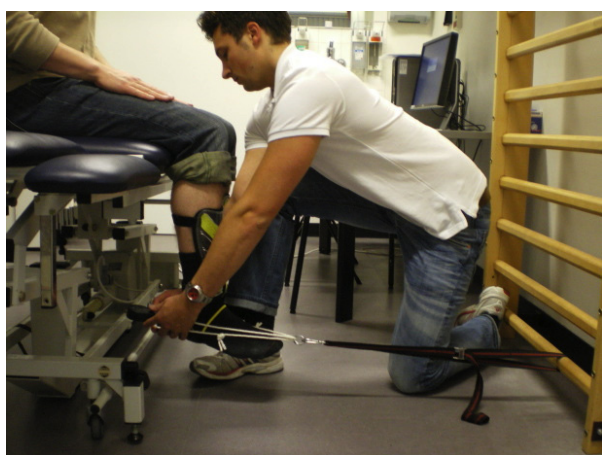
Figure 3 Clinical assessment of muscular isometric knee flexion strength using a modified hand-held dynamometer.

When analyzing this study's reliability using the SEM and SDD, high measurement error was indicated. Previous studies evaluating HHD, in contrast, have demonstrated only low to moderate measurement error in terms of SEM and SDD [14,22]. These studies, however, were performed on other populations and used non-modified HHD [14,22]. Results of the current study would, therefore, be more comparable with a study by