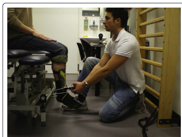
Figure 2 Clinical assessment of muscular isometric knee extension strength using a modified hand-held dynamometer.

Subject strength variation was evaluated using a boxplot. Interrater strength scores of flexion and extension in both knees were analyzed. Individual scores deemed outliers in 50% of occasions were excluded from the study sample.