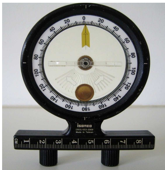
Fig. (1). Isomed Inclinator.

The experimental hypothesis for this study was that the intra-rater reliability of the investigator measuring thoracic kyphosis angle, lumbar lordosis angle and SLR will show acceptable intraclass correlation coefficients (ICC = 0.91-1.00) indicating reliability suitable for clinical measurements [19].