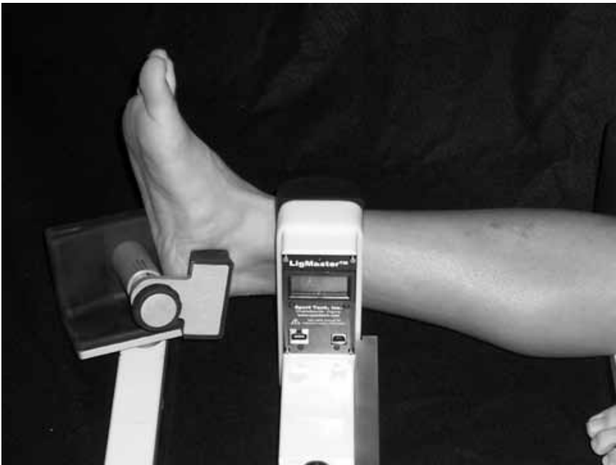
Figure 2 — Patient positioning for the talar inversion test.