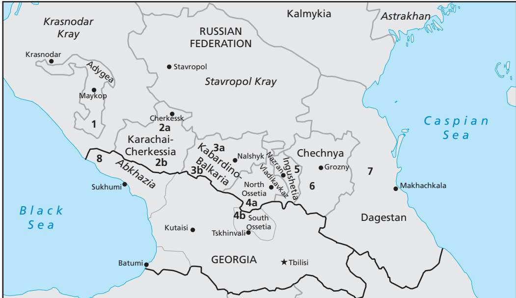
Figure 3.1 The North Caucasus

NOTE: The northwest Caucasus region encompasses Adygea (1), Karachai-Cherkessia (2ab); Kabardino-Balkaria (3ab), and North Ossetia (4a). The northeast Caucasus region encompasses Ingushetia (5), Chechnya (6), and Dagestan (7). There are also two South Caucasus regions: South Ossetia (4b) and Abkhazia (8), which are culturally and politically connected to the northwest Caucasus.