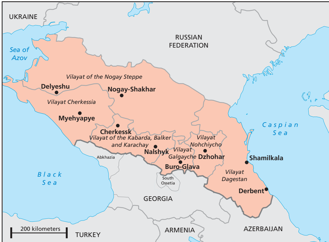
Figure 3.3 Republics Included in the Illegally Proclaimed Caucasus Emirate