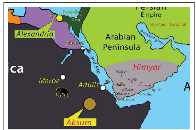
Figure 2 is a zoomed excerpt of the same map that focusses on the Horn and the Arabian Peninsula.