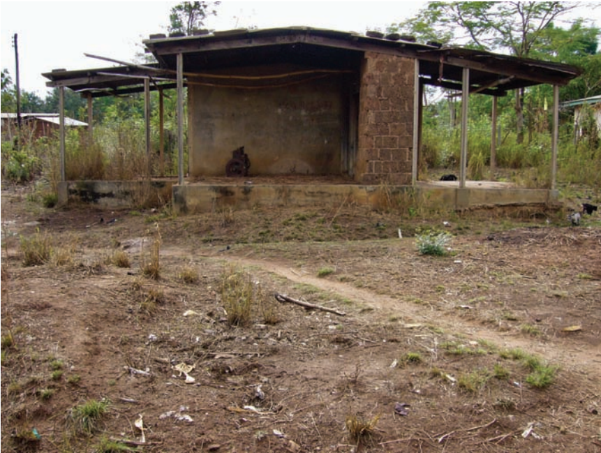
Figure 3. Resettlement core house abandoned before completion.

with obvious pathos on what might have been if history had taken a different path: