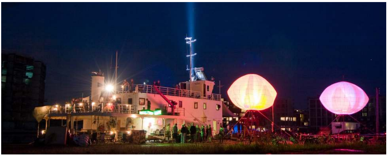
Figure 4: illutron collaborative interactive art studio