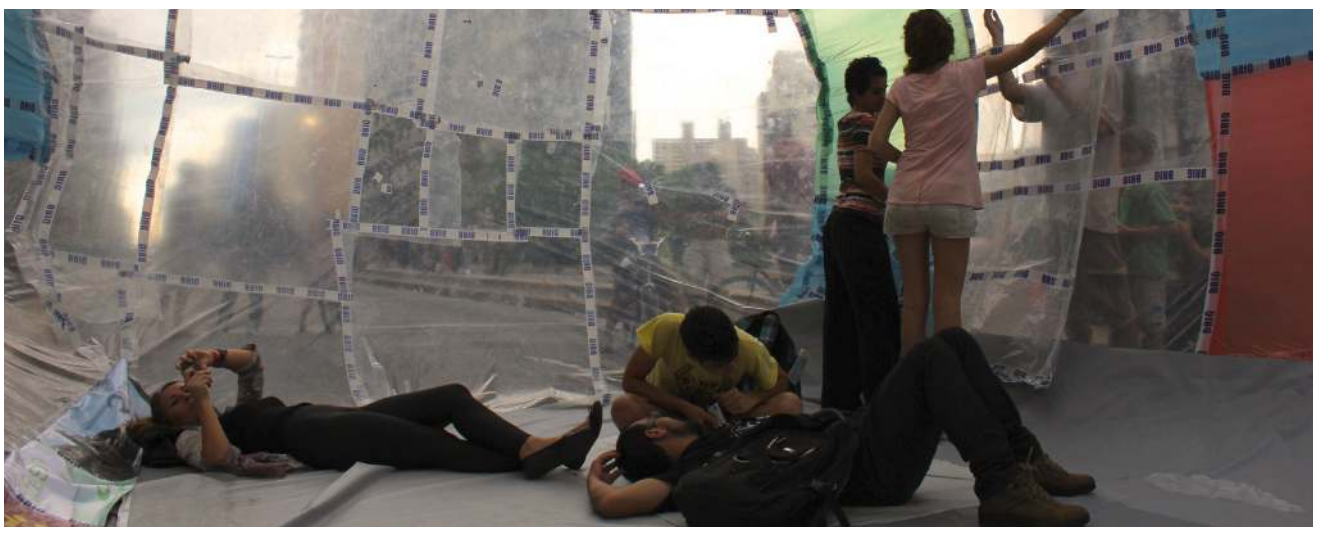
Figure 3: Muda Colletivo's inflatable bubble