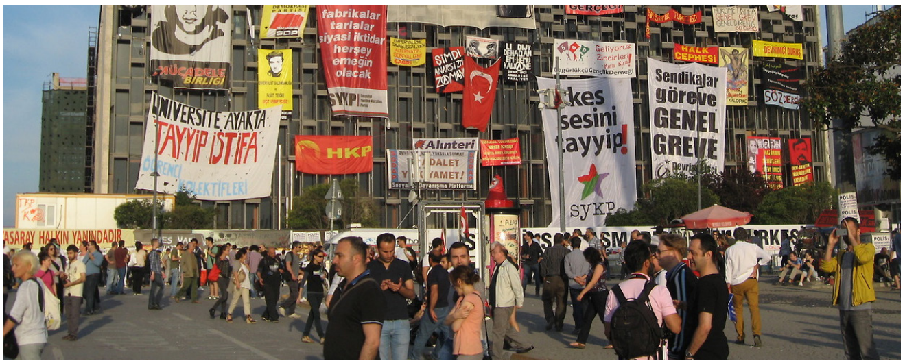
Figure 5: Occupy Gezi