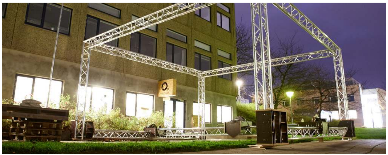
Figure 6: The giant 3D printer by Fablab RUC