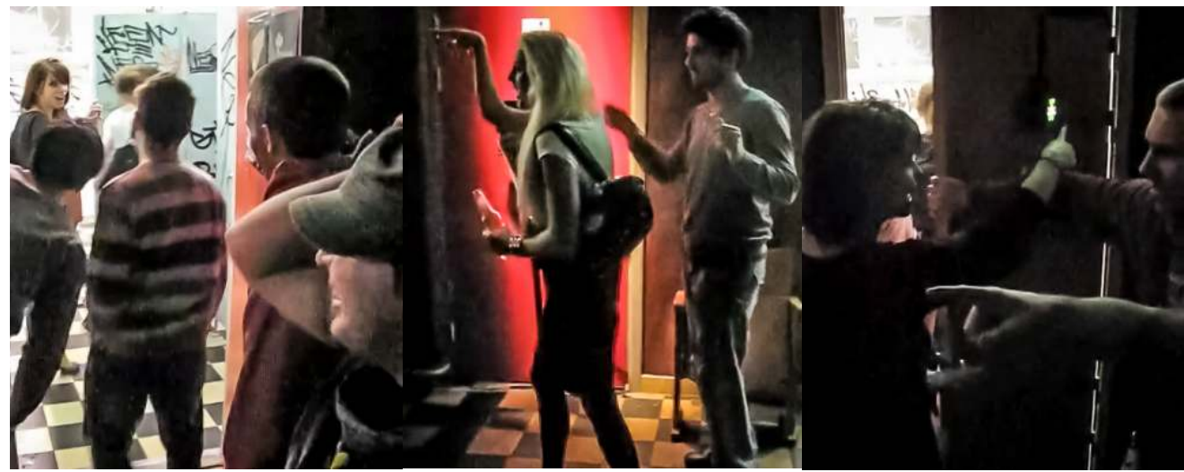
Figure 2: Stills from video documentation of Ladies' and Men's Room mixup