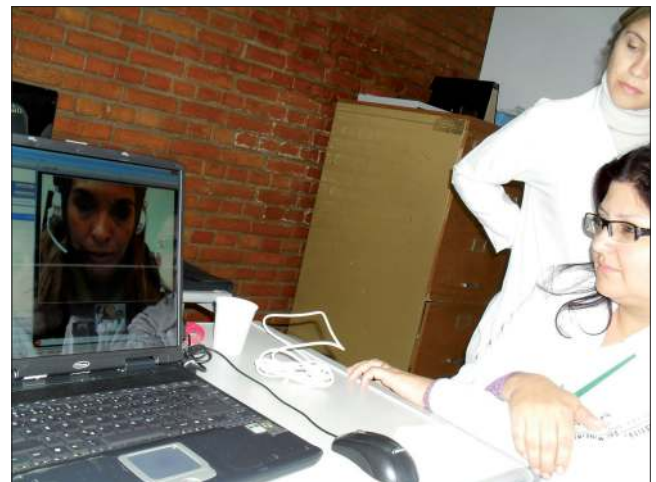
Figure 3. SU audiologist on the RU screen.