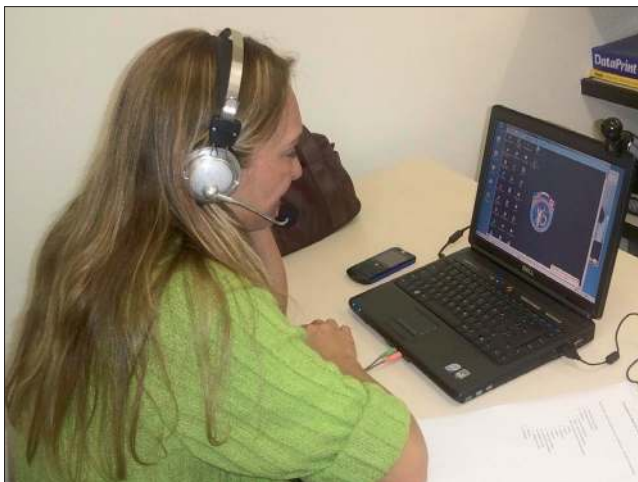
Figure 2. SU Audiologist.