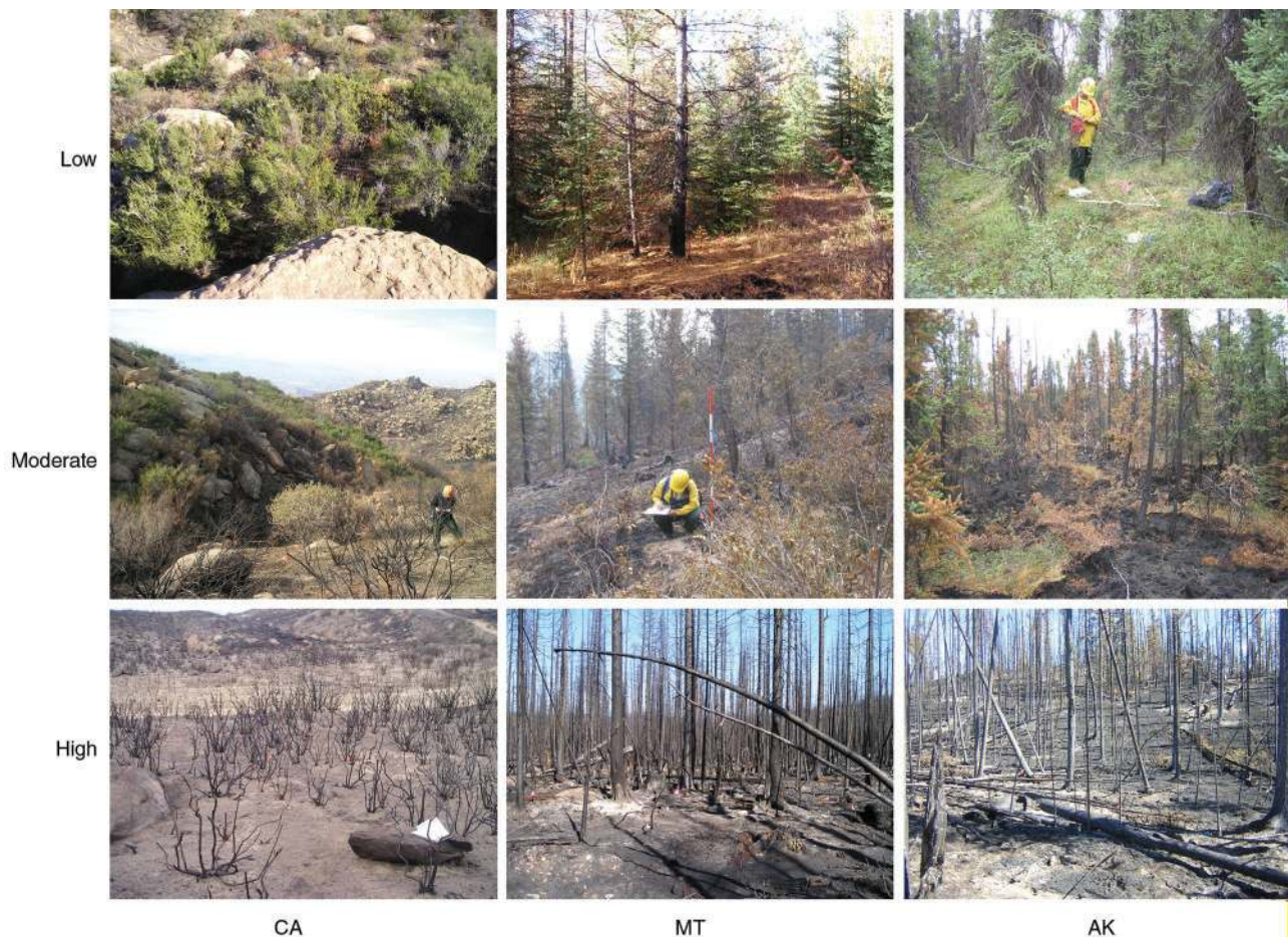
Fig. 1. Low, moderate, and high 'burn severity' sites in California (CA) chaparral, Montana (MT) mixed-conifer forests, and Alaska (AK) black spruce forests. Burn severity was classified via consistent visual assessment of ground and canopy fire effects.

correlations between field and remotely sensed measures of burn severity to post-fire wind and precipitation events that may have transported ash and soil off-site following fire in chaparral systems in southern California.