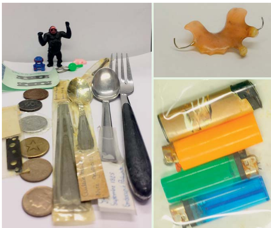
Fig. 1 Examples of foreign bodies retrieved from the upper gastrointestinal tract.

piration of saliva or from tracheal compression by the foreign body. Hypersalivation and inability to swallow any liquids are suspicious for complete esophageal obstruction [3–7, 10–15]. When the foreign body has passed the esophagus, the majority of patients remain asymptomatic but a sensation of foreign body, with dysphagia, can persist for several hours and thus can mimic a persisting foreign body impaction.