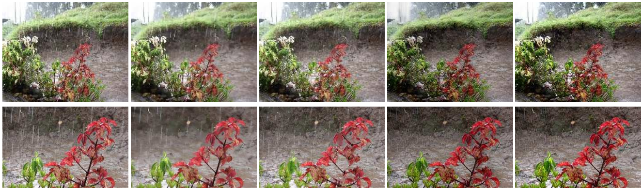
(a) Rain image (b) Kang et al. [14] (c) Kim et al. [15] (d) Algorithm 1.A (e) Algorithm 1.B Figure 6. Rain image "bush" and the results . The first row shows the full image and the second row shows one zoomed-in region.