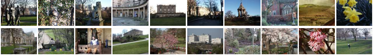
Figure 3. Some samples from the UCID dataset