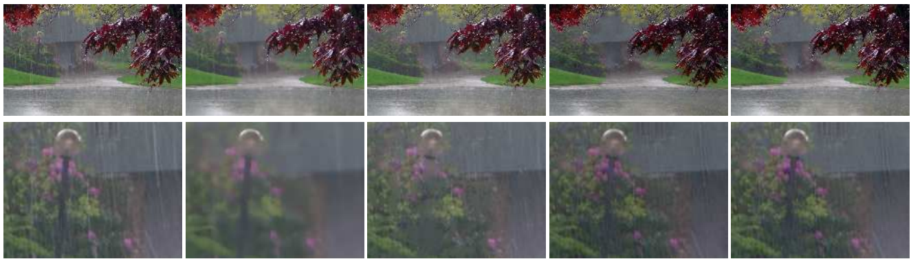
(a) Rain image (b) Kang et al. [14] (c) Kim et al. [15] (d) Algorithm 1.A (e) Algorithm 1.B Figure 7. Rain image "lamp" and the results . The first row shows the full image and the second row shows one zoomed-in region.