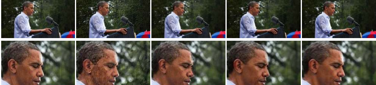
(a) Rain image (b) Kang et al. [14] (c) Kim et al. [15] (d) Algorithm 1.A (e) Algorithm 1.B