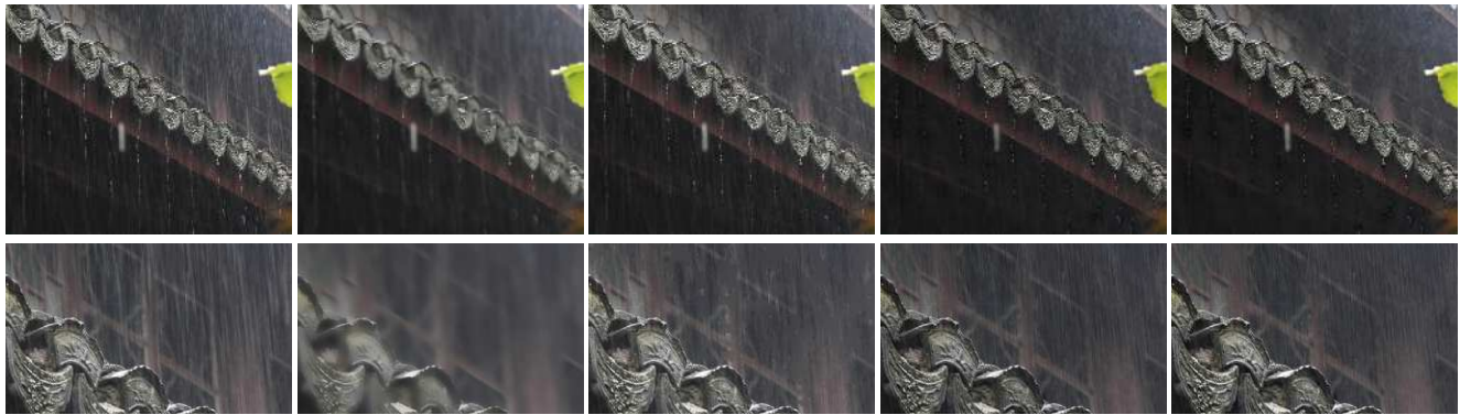
(a) Rain image (b) Kang et al. [14] (c) Kim et al. [15] (d) Algorithm 1.A (e) Algorithm 1.B Figure 5. Rain image "eave" and the results . The first row shows the full image and the second row shows one zoomed-in region.