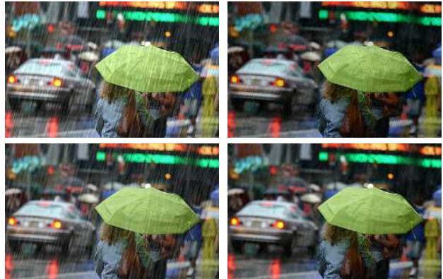
Figure 2. The first row shows the rain image synthesized using additive model (4) and the result from Algorithm 1.A; the second row shows the rain image synthesized using screen blend model (5) and the result of Algorithm 1.B.

rainy effect added using both screen blend model and additive model are shown in Fig. 2, as well as the results obtained from Algorithm 1.A and Algorithm 1.B. More results can be found in the supplementary material.