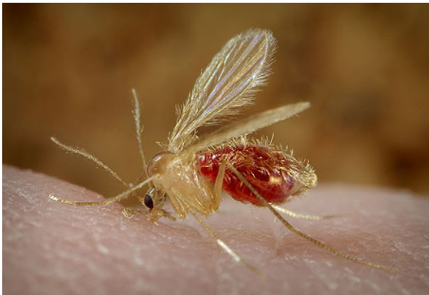
Fig. 2. Leishmaniasis is transmitted through the bite of infected female sandflies ( Phlebotomus sp. in photo).

of injury in the glomerulonephritis occurring in visceral leishmaniasis [11–15]. In 2007, Prianti et al. [16] observed a mesangial proliferative pattern of glomerulonephritis in Leishmania chagasi -infected mice. The presence of IgG deposits and the absence of C3b deposits in the glomeruli suggested that immunoglobulins may be involved in the pathogenesis of glomerular injury caused by kala-azar, while the complement did not seem to play an important role in the disease. However, both functional glomerular and tubular disturbances can complicate visceral leishmaniasis, particularly its chronic form [6].