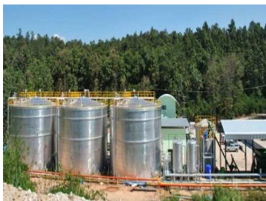
Figure 5. Biogas plant, Mae Taeng, Chiang Mai Province, Thailand [28].

The standard biogas plant was illustrated in Figure 5. Anaerobic digestion is an optimal way to treat organic waste matter, resulting in biogas and residue. Utilization of the residue as a crop fertilizer should enhance crop yield and soil fertility, promoting closure of the global energy and nutrient cycles [24]. The digestate byproduct is the result of a mineralization process which, in general, can be used as fertilizer since it is rich in nutrients (high nitrogen-to-carbon ratio), enhances nutrient-penetration into the soil and reduces up to 80% of odours from the feedstock [25, 26]. This high content is advantageous to the organic agricultural crops as they are primarily capable of utilizing ammonium nitrogen. The slurry from the digester is rich in ammonium and other nutrients used as an organic fertilizer [24]. It is often possible to replace nitrogen from commercial fertilizer by digested slurry and thus save money [27].