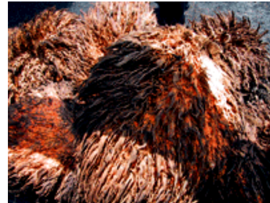
Figure 11: Empty Fruit Bunch or EFB of Oil Palm.

mills distributed all over the country it is estimated that Malaysia would be able to generate electricity power of approximately 2,400MW (K.S. Kannan, 2005; Mazlina Hashim,2005).