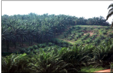
Figure 9: Oil Palm plantation in Malaysia (Source: www.earthscan.co.uk/ ).

Malaysia has been one of the largest producers and exporters of palm oil for the last forty years. Currently, Malaysia has approximately 3.87 million hectares of land under oil palm plantation (K.S. Kannan, 2005). Commonly, palm oil is cultivated for its oils, palm kernel oil and palm kernel cake as the commodity products. Today, there are many other uses for its co-products like empty fruit bunch or EFB palm fibre and shell which has great potential for energy production. Refer to figure 10 & 11 for picture of palm kernel and EFB.