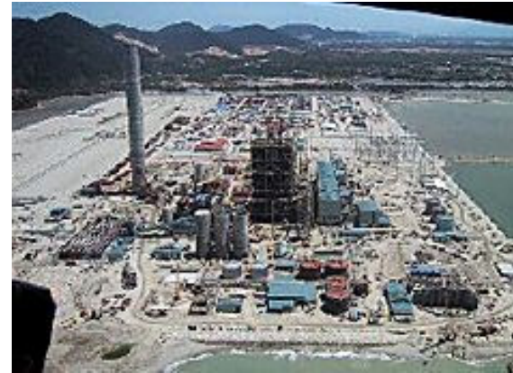
Figure 1: Manjung Power Station - Coal fired power station located on 285 hectares of reclaimed land.

Currently the biggest power station owned by TNB in Malaysia is the Sultan Ismail Power Station in Paka, Terengganu which is powered by oil and gas (Tenaga Nasional Berhad, 2006). Table 2 reveals the current use of fuel sources by TNB in eleven power stations. Malaysia's newest power station currently under construction at Jimah south of Kuala Lumpur is also based on fossil fuel which is a coal-fired power station. (Wagner, 21 March 2006). Refer to Figure 1 & 2 for other coal-fired power stations in Malaysia.