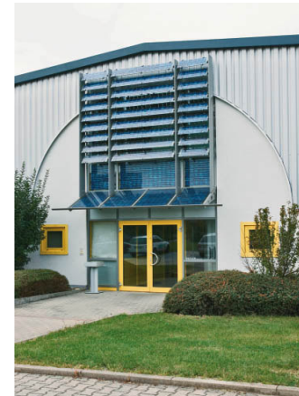
Figure 8: Building Integrated Photovoltaic for Canopy (Source: Schuco Solar, Germany).