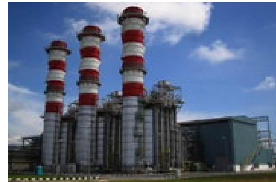
Figure 2: Perlis Power Station - Coal fired power station.