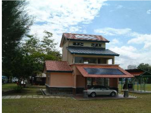
Figure 5: Building Integrated Photovoltaic.

Malaysia' (PTM), a government-owned company under the Ministry of Energy, Water and Communication.