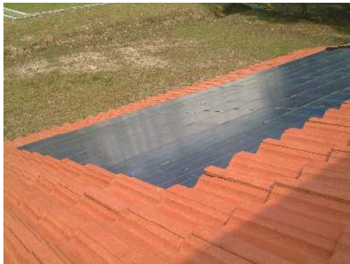
Figure 6: Building Integrated Photovoltaic for Roof Tiles (Source: Solar House, SIRIM Bhd., Shah Alam).