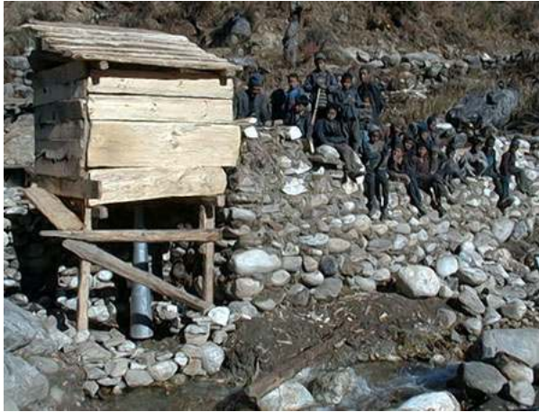
Picture 9: The Thalpi village people built the whole power house and stone/wood water canal, as part of their project input, thus being rightly proud of their pico hydro plant.