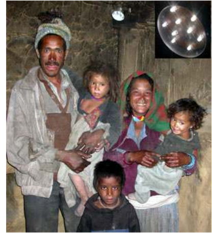
Picture 40: Total 189 WLED lamps in 63 homes are now installed in Chauganphaya.