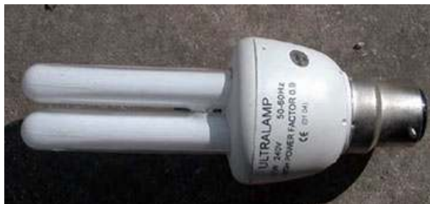
Picture 7: High quality CFL Lamp 11 watt (from Ultralamp), with a high Power Factor (PF) of > 0.9 , and with a life expectancy of 8,000 – 12,000 hours. Its light output can be compared with a 55 watt incandescent bulb.

While the future prospects for increased light output of WLEDs looks very promising 46 , some of the best WLEDs (as e.g. the Nichia NSPW 510BS with a 50° light angle), produce only 26 lumens / watt. However, we have already some of the latest WLEDs under testing (Nichia NSPW 500CS with a 20° light angle), which have been rated by the manufacturer to produce 56 lumens / watt. While still more WLED lamps have to be installed in order to match a CFL lamp's light output, the power generation can though be reduced by a factor five – ten for the same level of service.