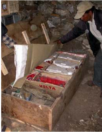
Picture 38: The battery bank well insulated in a locally made wooden box.