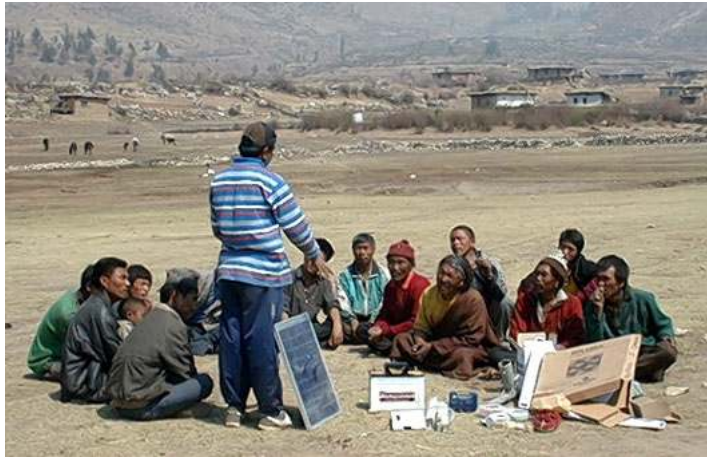
Picture 26: Training the end users to maintain and conduct basic repairs is crucial for sustainability of every solar energy project.