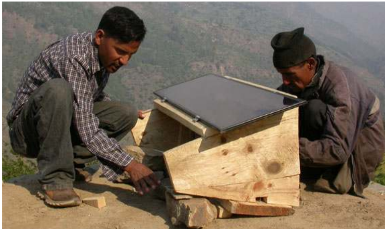
Picture 31: Project staff and user install the solar PV systems together, creating knowledge, skills and ownership