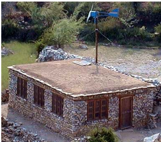
Picture 49: The self made wind turbine charges a 12 VDC battery bank of 150 Ah capacity, enough for one home.