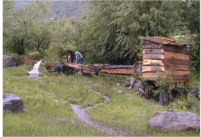
Picture 10: The power house, and the water canal of the Godhigau village 165 watt pico hydro power plant are built with local wood, with no cement which is prohibitive expensive.