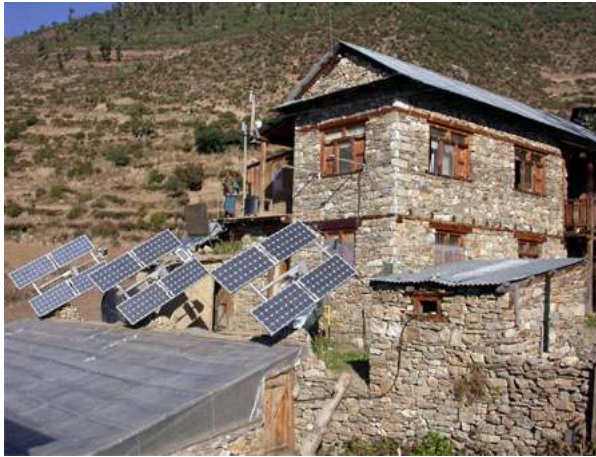
Picture 52: HARS in Simikot Humla at 30° northern latitude and 3,000 meter altitude.

To implement newly developed equipment and technologies is always a risk, thus in the case of the Humla HCD projects, the HARS (High Altitude Research Station) has been built (picture 52). At HARS all newly developed technologies intended for village use, are first monitored and tested, and if necessary they are improved (see e.g. the high altitude SWH for the Dhadhaphaya village, which is at the time of writing in its test phase at HARS as indicated in pictures 2 & 3). This quality assurance process will keep the failure rates and system downtimes in the villages to a minimum. Experience shows, that sustainability and appropriateness are key aspects of a project that