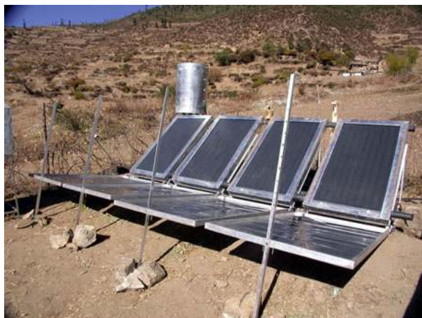
Picture 2: First unit of the Nepali made High Altitude Thermo-Siphon SWH, with opened reflectors, designed to act as night time insulation, beside the ability to empty the absorbers and pipes. A horizontal and 40° fixed angle (same as the absorbers) pyranometer, allow the monitoring and recording of the actually received solar irradiation on the total absorber surface for exact efficiency calculations. The full size (4 units) of the High Altitude SWH bathing center system is designed to provide hot water for 1,100 people, for each to take a shower every two weeks.