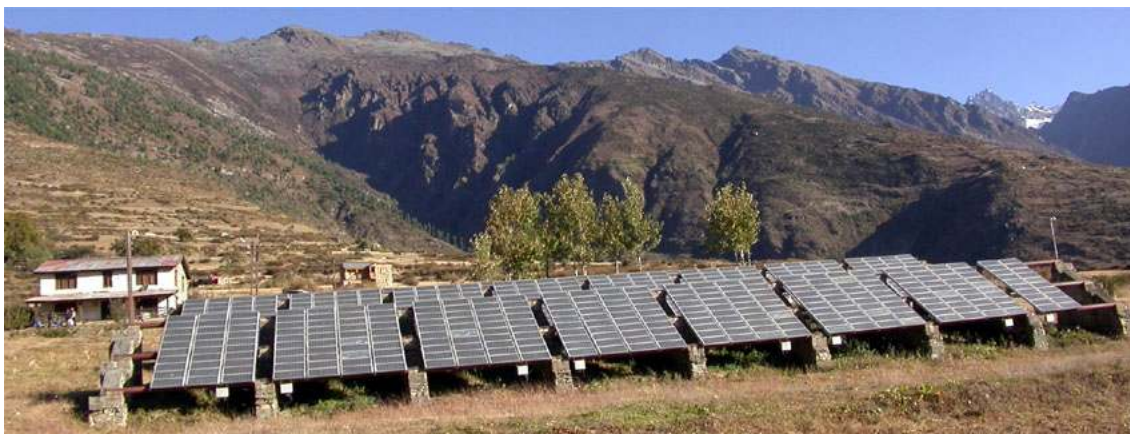
Picture 1 35 : Simikot Humla 50 kW R Solar PV System, after 16 years of operation

NEA has installed as part of a French government development project in 1989 three solar PV array systems in three remote areas (30 kW R in Kodari, 50 kW R in Gamghadi and 50 kW R in Simikot), out of which the last two are still considered to be operational in the latest NEA power development graphs and charts 34 . Since October 2003 the Gamghadi system has totally failed, leaving the people, who have had simple low power lighting in their homes for 14 years, again in the dark. The Simikot system (see picture below) provides since the late 90s only DC power (both the 5 kW and a 50 kW inverters failed due to lack of maintenance/repair funds, spare parts and skilled professionals). For ~ 100 households with each one to three 40 – 60 watt incandescent bulbs not connected to an on-off switch, only 1–2 hours per day indoor lighting is provided.