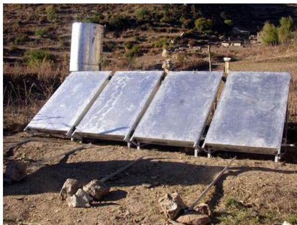
Picture 3: The High Altitude Thermo-Siphon SWH in closed, or after sunset, position. The insulation all around the absorbers and the hot water storage tank consists of 100 mm polyurethane foam. Four thermocouples on one absorber measure the water temperatures at different heights, and 4 thermocouples, installed at different heights, measure the hot water storage tank temperature and stratification. All data is recorded every minute for the first 5 months of field tests during the winter of 2005/6. Initial efficiency calculations showed values of 45% - 55%.