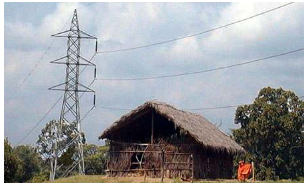
Picture 4: Even though this resident had to provide land for transmission poles, it has not enabled the electrification of the home.

All of these conditions have placed great pressure on NEA, and the company has recently been restructured into three business units, the generation, transmission and distribution and customers services (retail) 41 . These units now aim to become profit-making businesses. Thus there is now even less hope for future rural electrification projects through NEA, which are non-profitable but serve the poor and remote mountain communities. Further, existing rural power generation plants are being sub-contracted either to interested private companies or to the communities themselves, to run them as local businesses. But most of the micro hydro power plants have been originally designed and built with the traditional approach “100 watts per household” for incandescent bulbs, making them too big and too costly for the local communities to maintain and repair.