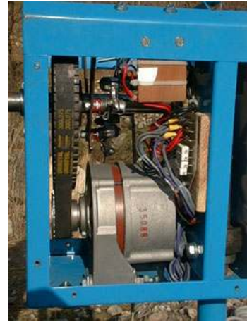
Picture 48: Bosch K1 14 volt 35 amps car alternator, 1:4 wheels with belt set system, capacitors, electronic circuit plate, brakes