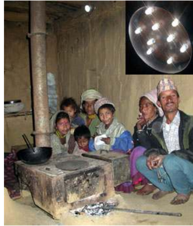
Picture 39: The light project is never on its own. The metal stove is always part of it.