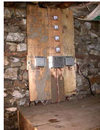
Picture 37: Charge- / discharge-controller, with separate load controller, inside the power house.