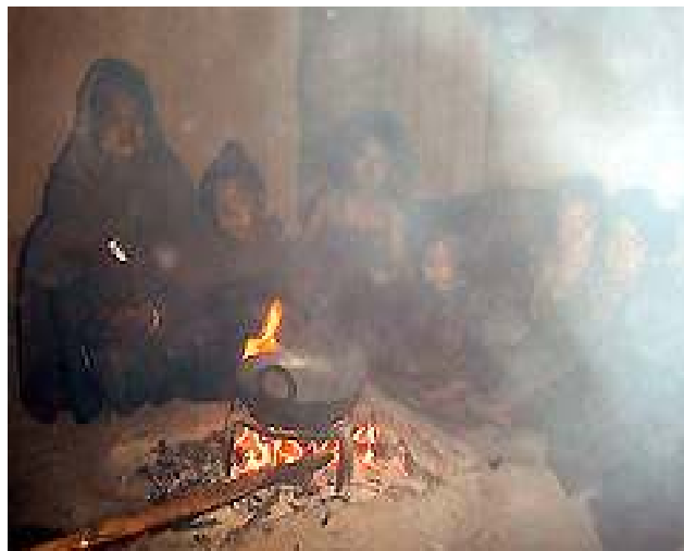
Picture 6: Open fire place cooking is the traditional and common way to cook the daily food. The mother, and often the children, sit around the smoky fire as the meals are prepared. Women and children are most likely to suffer from exposure to the indoor smoke pollution 43 , causing health hazards such as respiratory diseases, asthma, blindness and heart disease 44 .

In this context, what options are available other than the smoky "jharro" for providing light for each home, light that is necessary for cooking, evening gatherings and children's study times?