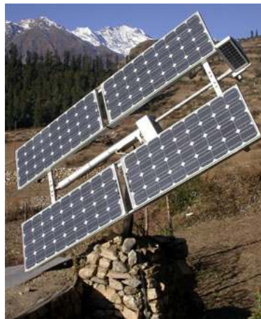
Picture 36: The tracker follows the daily sun path from east-west, and back in the morning to east, by itself.