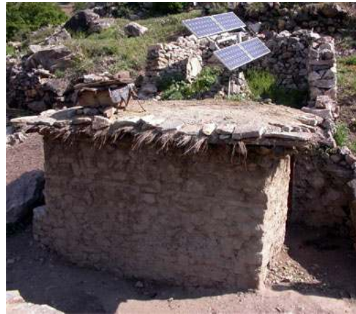
Picture 34: The local people built the power house with their own materials. It contains the battery bank, which provides up to 5 days power for all the lights during no-sun days, and a charge and load controller (pictures 37 & 38).