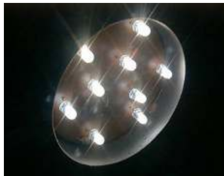
Picture 8: Nichia NSPW 510BS (9 diodes with a 50° light angle) WLED lamp, consuming 1 watt, with a life expectancy of > 50,000 hours

Our aim was to design an elementary rural village electrification system for lighting purposes for the poorest and most remote mountain communities in Nepal. It is obvious that WLED lamps are the most appropriate and sustainable solution to fulfill the local people's identified demands for minimal lighting. Their high availability (light emitting diodes are almost unbreakable compared