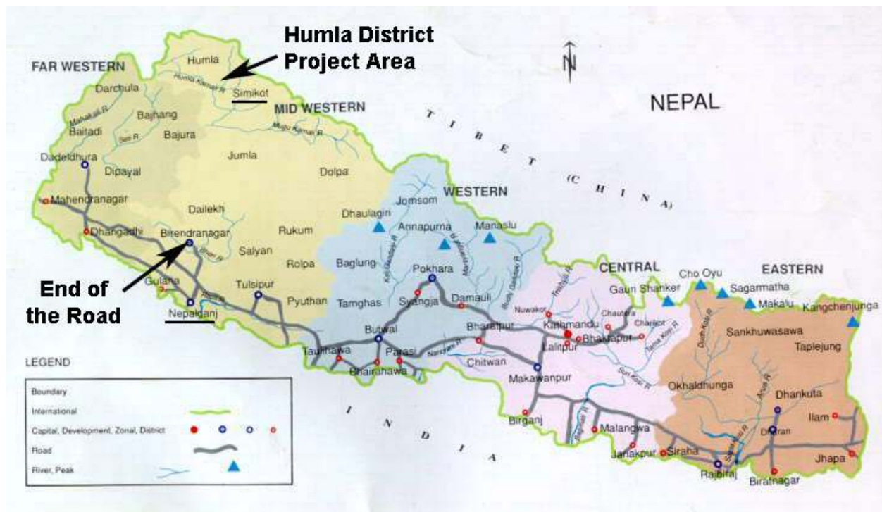
Figure 1: Nepal map (with author's adjustment). From the "End of the Road" one either has to walk 16 days to Simikot (Humla district), or take a one hour, adventurous airplane journey through the Himalayas from Nepalgunj (in the very south at the India boarder) to Simikot.

The national average electricity consumption per capita in the 2003 - 2004 fiscal year was just under 70 kWh/year 12 , placing Nepal among the lowest electricity consumers in the world.