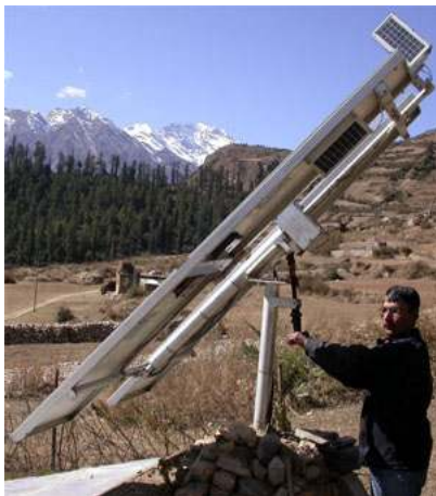
Picture 35: The north-south axis can be changed from 5° to 60°, according to the sun's seasonal position.