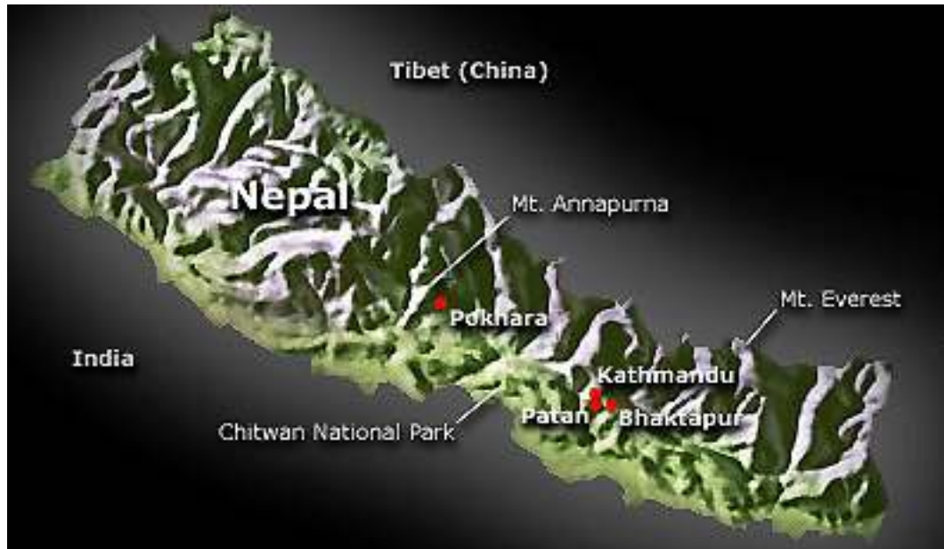
Figure 3: Relief Map of Nepal shows some of the major deep north-south valley, creating a natural Venturi effect. Map: http://www.bugbog.com/maps/asia/nepal_map.html

With the huge water resource, a maturing hydro power industry, and increasing awareness and implementation of solar PV projects under governmental subsidy programs, it comes as no surprise that hardly any wind generation projects have been implemented in Nepal.