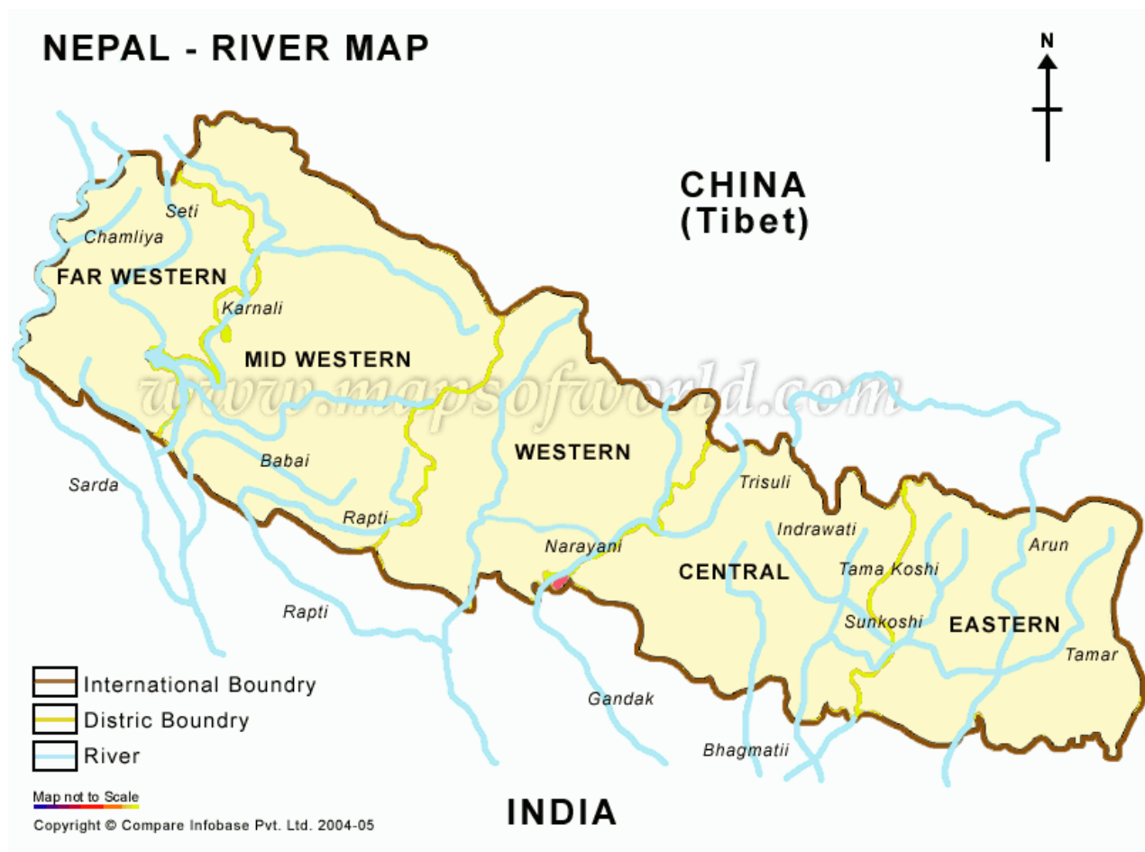
Figure 2: Some of the major rivers of Nepal, with that enormous north – south drop, from the 6,000 – 8,000 meter altitude of the Himalayan range to the north, to the flat southern part, which is just above sea level. Map from: http://www.mapsofworld.com/nepal/nepal-river-map.html

Since 2003 a total of 576 MW 23 rated power capacity, from 23 installed hydro power plants has thus far been realized. Thus, today a mere 1.37% of the technically and economically feasible hydro power potential of Nepal has been developed. During the 2003 – 2004 fiscal year the total annual energy generated was 2,381 GWh 24 , which implies a capacity factor of just over 47%. With an national average electricity consumption per capita in the 2003 - 2004 fiscal year of just under 70 kWh/year 25 , including the enormous energy loss of ~ 24%, accredited mainly to the large grid transmission line losses and power theft, compared to around 900 kWh/year 26 for most of the developing countries, puts Nepal among the lowest electricity consumers in the world.