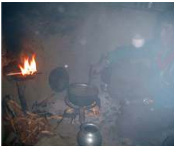
Picture 5: Open fire place cooking and "jharro" burning. The traditional way of having a small dim light inside the home is the "jharro" (resin soaked pine wood stick burning to the left, with a one evening ration ready to be burned at the bottom left). Burning "jharro" emits thick black smoke which adds to the already unhealthy conditions created by open fire place cooking