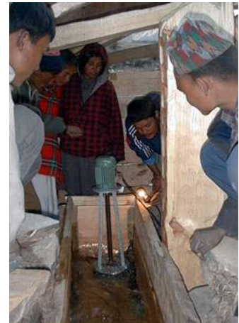
Picture 14: First test if light can be generated. What a life experience!