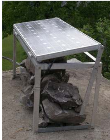
Picture 28: One 75 W R module, adjustable to the season, fixed with stones