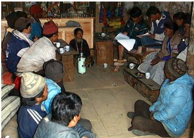
Picture 19: The first step is always to raise awareness in the community and to inquire and define what their needs for energy services are.

Therefore it is recommended that SHS projects should be run as part of a long-term holistic community development project, with the end users as active partners (participating through their voluntary work as well as some financial contribution) together with the implementer (who works on a long-term basis in that area) and the donor agency (who provides the main project funding according to an agreed project proposal and budget). The following pictures show SHS implemented in Khaladig village in Jumla, as part of a holistic community development project.