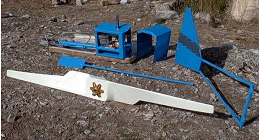
Picture 47: Self made 2 bladed wooden wind turbine, wooden tail with metal frame, and a Bosch car alternator as power generator. The wooden blades are hand carved aerofoil shaped blades with a blade diameter of 205 cm. From ~ 300 Rpm onwards the wind generator provides 12 volts to charge the battery bank.