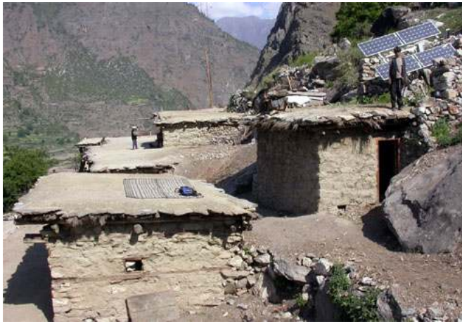
Picture 33: In the middle of the village of Chauganphaya the local people have provided the land to build the central solar PV system power house. From the power house all homes are connected via armored underground cable, buried at a depth of 50 – 80 cm.

The whole system is protected with a central electronic fuse, so that any misuse or overloading of the system causes the immediate shut down of the system. The electronic fuse was developed because it is not possible, in such remote places, to get any glass fuses which are commonly used otherwise in solar PV systems. Experience shows that many SHS have failed because the charge controller glass fuse broke and the users either did not know that there was a fuse, as they were not trained to maintain the system, or they could not get a spare glass fuse in the local market. Some months later, when the battery has not been recharged it fails too and normally that's the end of the SHS and the dream of light inside the home.