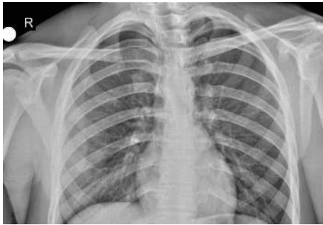
FIGURE 1: Preop radiographs.