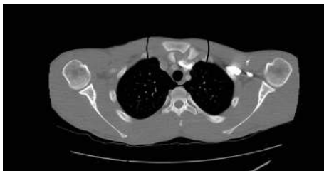
FIGURE 2: Preop CT.

medial end of clavicle, as to cross both cortices. Six mm polyamide nonabsorbable type sutures passed through these holes and fixated using tension band technique (Figures 3 and 4). Cartilage and joint capsule were repaired as far as possible using 2/0 nonabsorbable suture, and then the torn part of the sternocleidomastoid muscle tendon was sutured onto the capsule. Sternoclavicular joint reduction were evaluated by X-ray and CT images after surgery (Figures 5 and 6). The patient was immobilised by postoperative figure eight bandage and shoulder-arm brace; they were kept for 4 weeks. During control at the postoperative 6th week, the range of motion at the shoulder was complete, but the patient had mild pain at the level of joint. He did not have any pain at the postoperative 10th week. Assessment with ASES shoulder score showed that there was no difference between right and left shoulder movements.