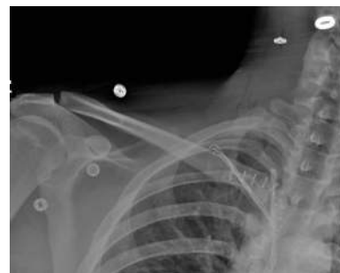
FIGURE 5: Postop radiographs.