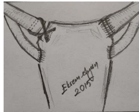
FIGURE 4: Schematic.