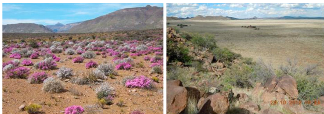
Figure 2. Typical landscapes of Succulent Karoo (left) and Nama Karoo (right) biomes.

Changes in the global economy, including the falling wool price and the widespread economic recession, together with national trends such as a rapid increase in the human population, unemployment and rising costs of fuel and electricity, are currently driving changes in landuse in the Karoo (Atkinson, 2008, 2009, undated; Western Cape Government, 2014). Sheep farms that are no longer economically viable are being consolidated and converted to game farms for hunting and tourism, often with absentee owners. With the demise of the farming economy rural villages are losing services (banks, schools, hospitals) despite growing populations (Toerien & Seaman, 2010). Unemployment is on the increase and most rural families depend on government