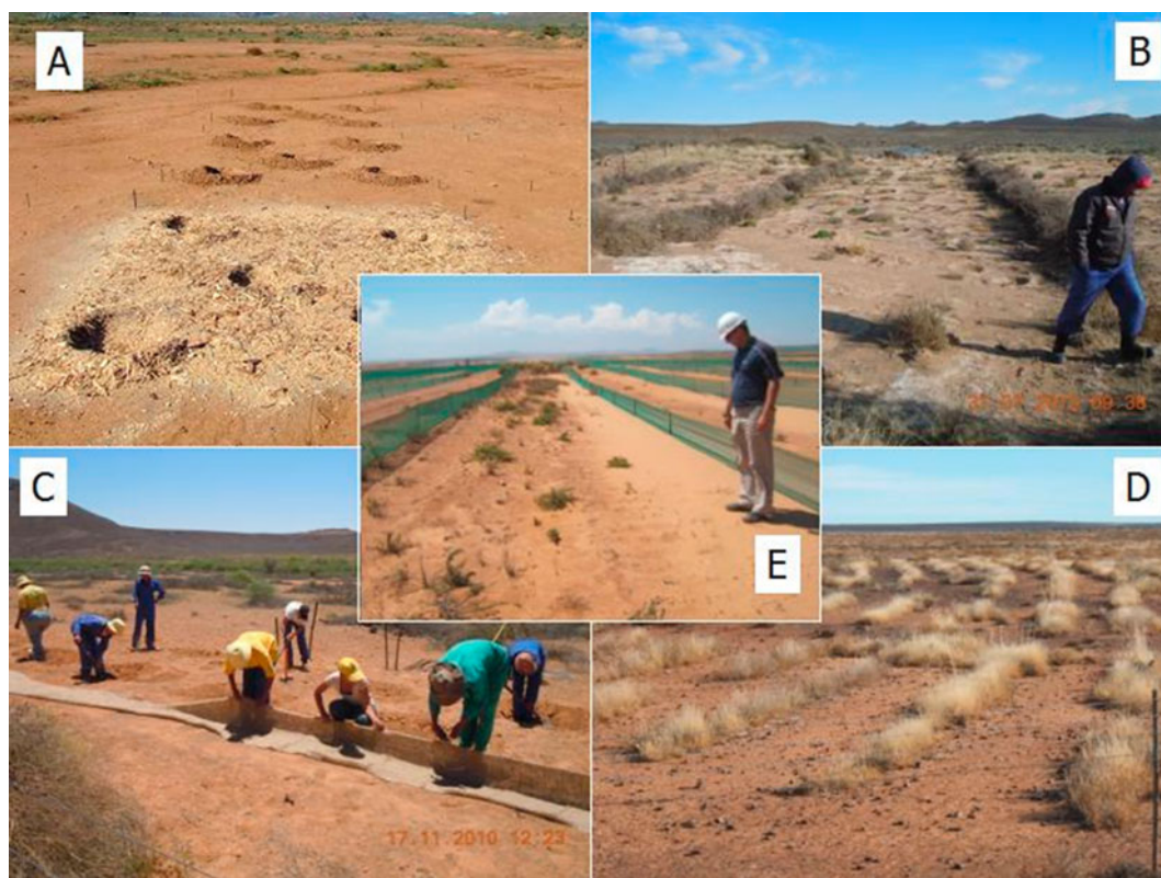
Figure 6. Approaches to improving water infiltration and reducing windspeed during rehabilitation of bare soil in the Karoo (A) pits and mulch, (B & C) Pits and water barriers, (D) ripping and sowing of grass seed, and (E) topsoiling with wind barriers.

current value of the land or its annual production (Blignaut et al. , 2013).