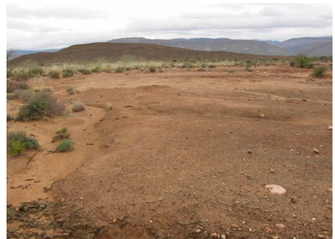
Figure 5. Khoekhoen sheep kraal abandoned around 250 ybp.