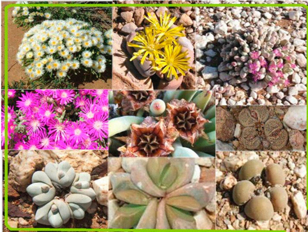
Figure 3. Diversity of Mesembryanthemum (Aizoaceae) species in Succulent Karoo.

2009, Le Maitre et al. , 2009), should be traded for quick solutions to the national energy crisis based on uranium and gas deposits that may last for only a few decades.