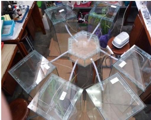
Fig. 1. First modified olfactometer