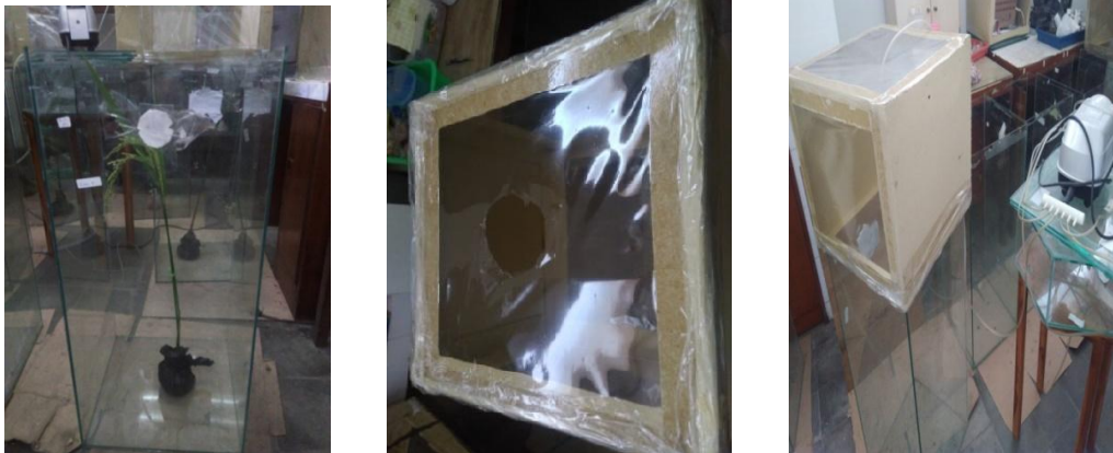
Fig. 3. Detail of the second modified Olfactometer. From left to right – Cage with rice plant, the hole bottom of cardboard as glass cover replacement, connection of cage, covers and aerators