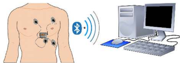
Figure 1. Scheme of local acquisition and transmission of physiological data using Shimmer™ device (adapted from [24]).

With these possibilities, the research team is developing a web interface for measuring, recording and processing the various signals acquired remotely from both human body and physiological systems simulators.