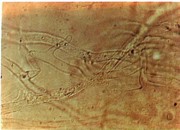
Fig. 2. Direct microscopy of nasal discharges prepared in potassium hydroxide solution, showed broad and branching hyphae ( \times 400).