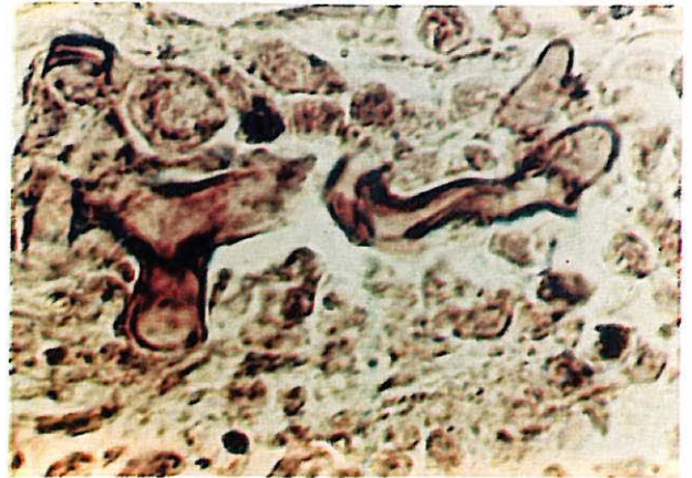
Fig. 3. Ribbon-like hyphae in tissue (PAS \times 1000).