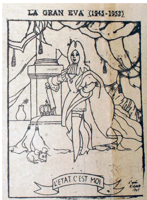
FIGURE 2: "La gran Eva (1945-1952)." La Vanguardia (circa 1952)

After the aforementioned shuttering of La Vanguardia , later Socialist publications, most notably Nuevas Bases , began to temper their attacks on the Peróns. Pictorial criticisms of the Peronist movement veiled their criticisms of Perón and Evita, replacing them with the figure of Rosas. Therefore, in the May 1 st , 1951 edition of Nuevas Bases we see a caricature of that 19 th century caudillo reading that the Pronouncement of Urquiza was not being commemorated. 55 Despite a decrease in the number of graphic criticisms of Perón and Eva, the Party kept up its denunciations of Peronist forms of celebration. Here we see their repudiation of a project that would have used executive power to order the minting of a golden coin with Perón's image on its obverse and the phrase "Nation, Just, Free, and Sovereign" inscribed on its other side. 56 Socialists also denounced official pronouncements that praised Evita. 57 The Party criticized a law passed in the province of Salta that stipulated that schools should erect