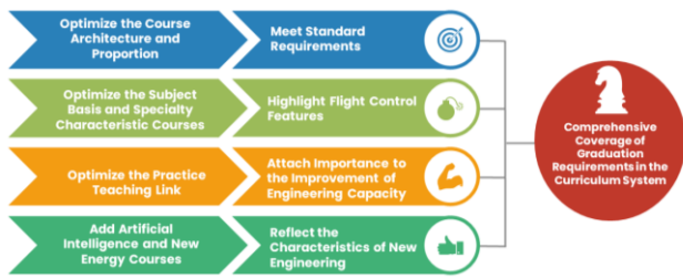
Fig. 3 The implementation method of "three optimizations and one addition"

curriculum system, it is based on the construction idea of the curriculum system.