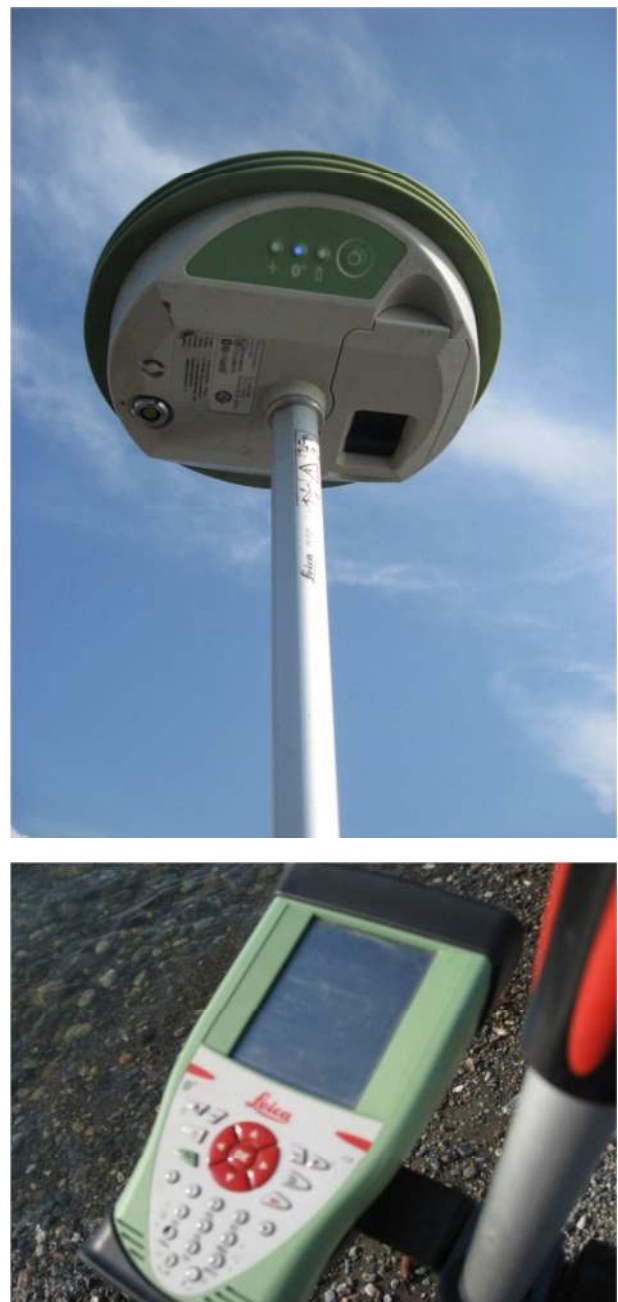
Figure 1. Differential GPS-receiver Leica GS0.

contains water body and river bed above it, the length of which was at least two-times bigger than water body length. Planning of SP and its bench was made taking into account the frequency of floods and freshet of tributaries. Field studies were carried out using a differential GPS-receiver Leica GS08 (fig. 1), which is connected to a network of the National Agency of Public Registry and provides a high precision ( \pm 5 cm) of geodetic measurements throughout the country. For analysis of obtained results were used the methods of mathematical statistics (least square method) and differential calculus (bounds method). Approbation of calculation results were implemented at Gumati reservoir, which is constructed at the Rioni River in 1953 (West Georgia), and Sioni reservoir, created at the Iori River in 1963 (East Georgia).