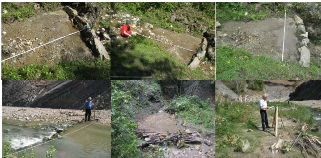
Figure 2. Natural experiment at mountain debris flows.