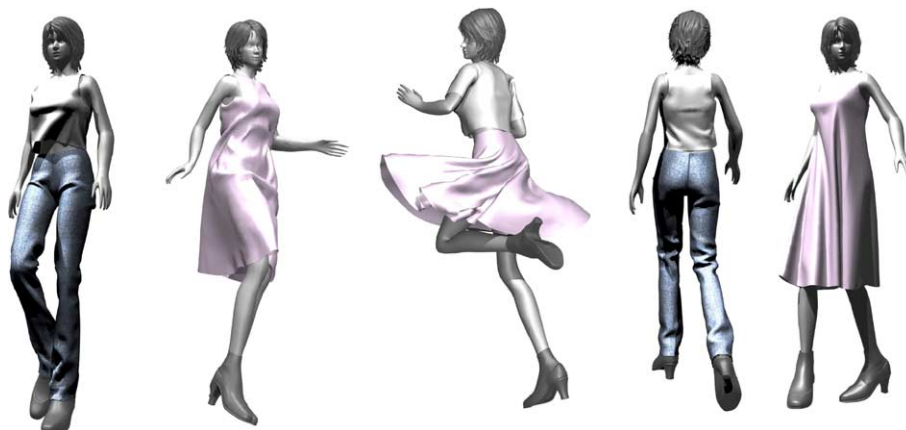
Fig. 2. Snapshots from Choi and Ko's work [8].

Currently, most cloth simulations use interacting particle models. An alternative to this approach is to model the cloth as a continuum. The finite element procedure, which is commonly used to analyze structural problems in solid continua, has several advantages over the interacting particle approach. For example, the continuum formulation is largely parameterization independent, even though regularly shape-and-sized discretization is required