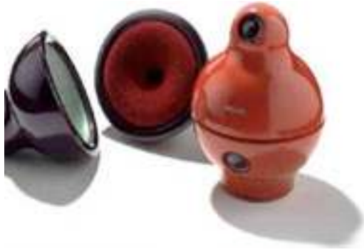
Figure 3. Concept from Philips' vision of the future project.

extensible, as numerous undergraduate and graduate programs in interaction design have imitated the project.