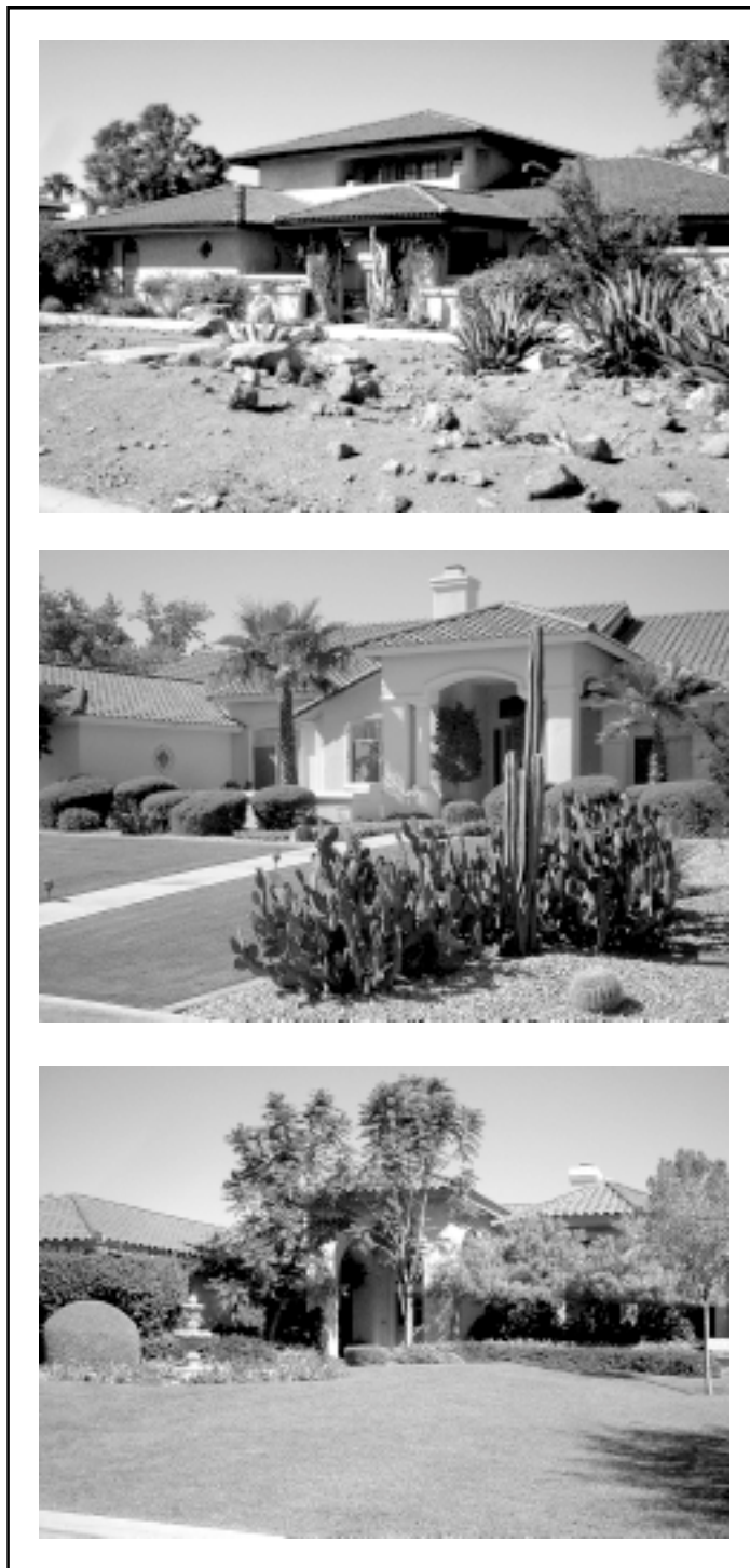
Figure 2. Typical desert (top), oasis (middle), and mesic (bottom) landscape design motifs of residential homes studied in the Phoenix, Arizona, metropolitan area.

We hypothesized that people relocating to Arizona from less arid climates, such as in the eastern United States, would prefer green landscapes because they are legacies of a former home and because these homeowners are recalcitrant to accept the principles of xeriscape landscape design and desert landscaping that are more popular among long-standing Arizona residents. We tested these hypotheses by determining if homeowner's geographic place of origin and length of Arizona residency had an influence on preferences for desert, oasis, or mesic landscape motifs. Surprisingly, we found that the average length of Arizona residency for homeowners preferring desert, oasis, or mesic landscape designs was 9.2 \pm 0.6 , 11.7 \pm 0.5 , or 10.8 \pm 0.9 years, respectively. We also found that the lowest percentage of respondents (16%) who preferred desert landscape themes and the highest percentage of respondents (33%) who preferred mesic landscape themes were Arizona natives (Table 4).