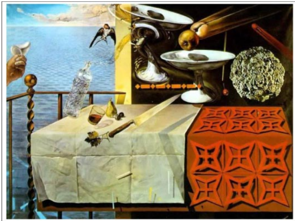
Nature Morte Vivante (Still Life - Fast Moving)

Fig. 2. The challenge of integrating diverse disciplinary perspectives is to retain the precision of diverse elements of the whole to create an overarching picture. The results may seem strange, unrealistic, and surprising, but they allow for novel approaches and new questions to arise. The painting is Nature Morte Vivante (Still Life Moving Fast) by Salvador Dali, 1956, 125x160 cm. The original is in the Salvador Dali Museum, St. Petersburg, Florida, USA.