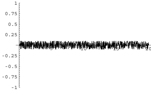
Fig. 2. Simulated correlation function g(t) between the points 4P_i and power consumption C_i(t) when d_{\ell-2} = 1 . No peak is observed since the points 4P_i are never computed by the card.