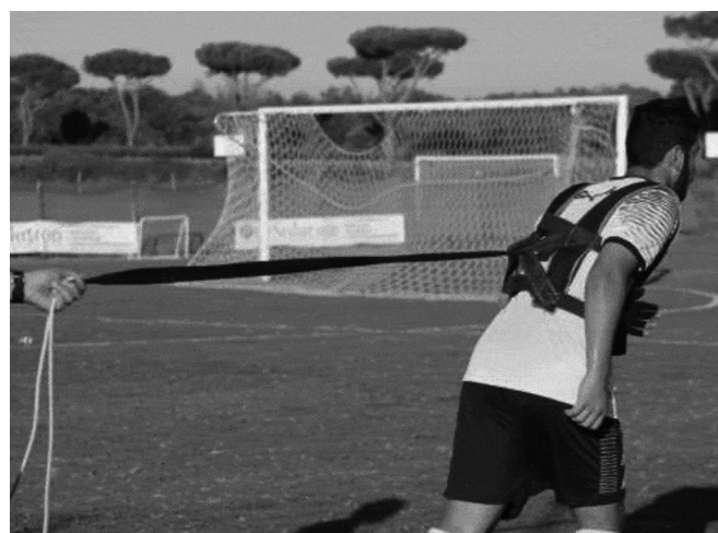
FIG. 2. Resistance-sprint harness