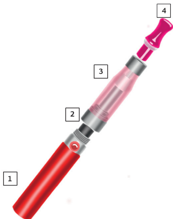
Figure 1. Structure of an e-cigarette. E-cigarettes have some basic components as shown, although new generations have changed considerably the shape. Most current models differ considerably from a cigarette. 1: Battery: usually rechargeable, and as other batteries with the possibility of leaks and explosions. 2: Heating coil: amount of vapor depends on temperature, and new devices can modify it. 3: Vaporizing chamber: includes a wick in touch with e-liquid, with different flavors and nicotine content. 4: Mouthpiece.

The first commercially available e-cigs device was developed in China, in 2003, as an alternative to smoking in places where smoking regular cigarettes were prohibited 3,4 . It was named Ruyan, a Chinese word for “resembling smoking,” and unlike nicotine patches, gum or lozenges it was not designed as a pharmacologic tool for smoking cessation but to deliver “enjoyable” nicotine and overcome regulations 5 .