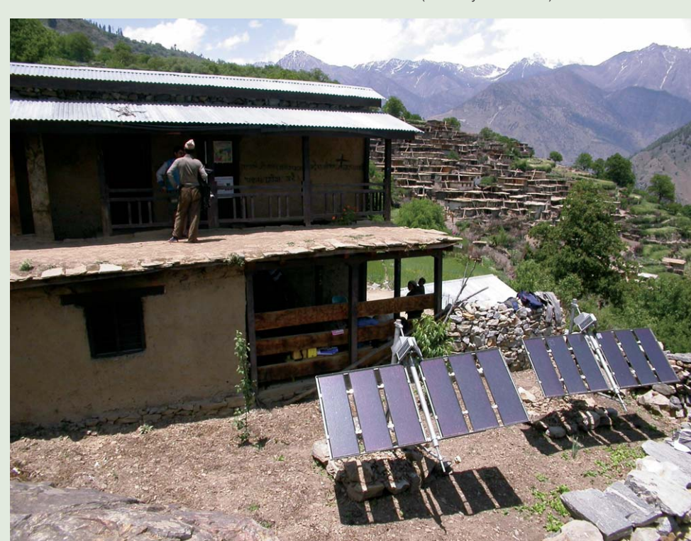
FIGURE 4 Photovoltaic panels for solar energy close to a village in the project area.

Informed by this understanding, we analyzed our cultural, socioeconomic, and attitudinal data from the baseline studies we conducted in a village prior to enter-