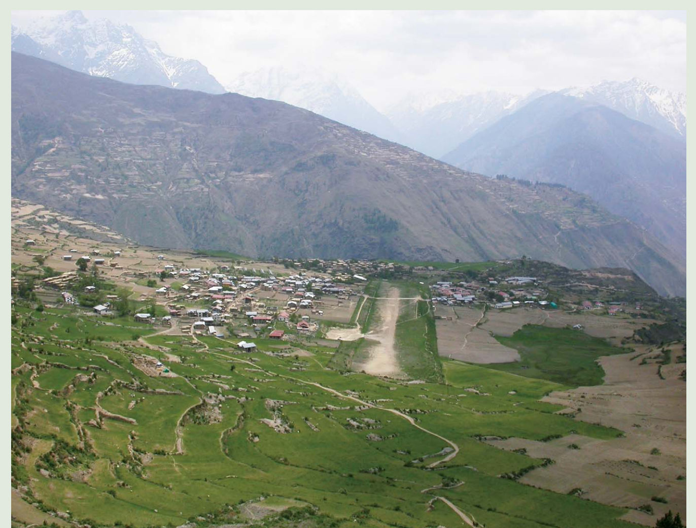
FIGURE 1 Simiko, Humla District Headquarters; the project site is within a 1-day walk.

the produce of their own land and herds have been described as "risk-averse" and culturally "conservative," and as preferring not to adopt new technologies and farming or husbandry methods that might negatively impact their ability to make it through the next dry or cold season. We have been living and working with agropas-