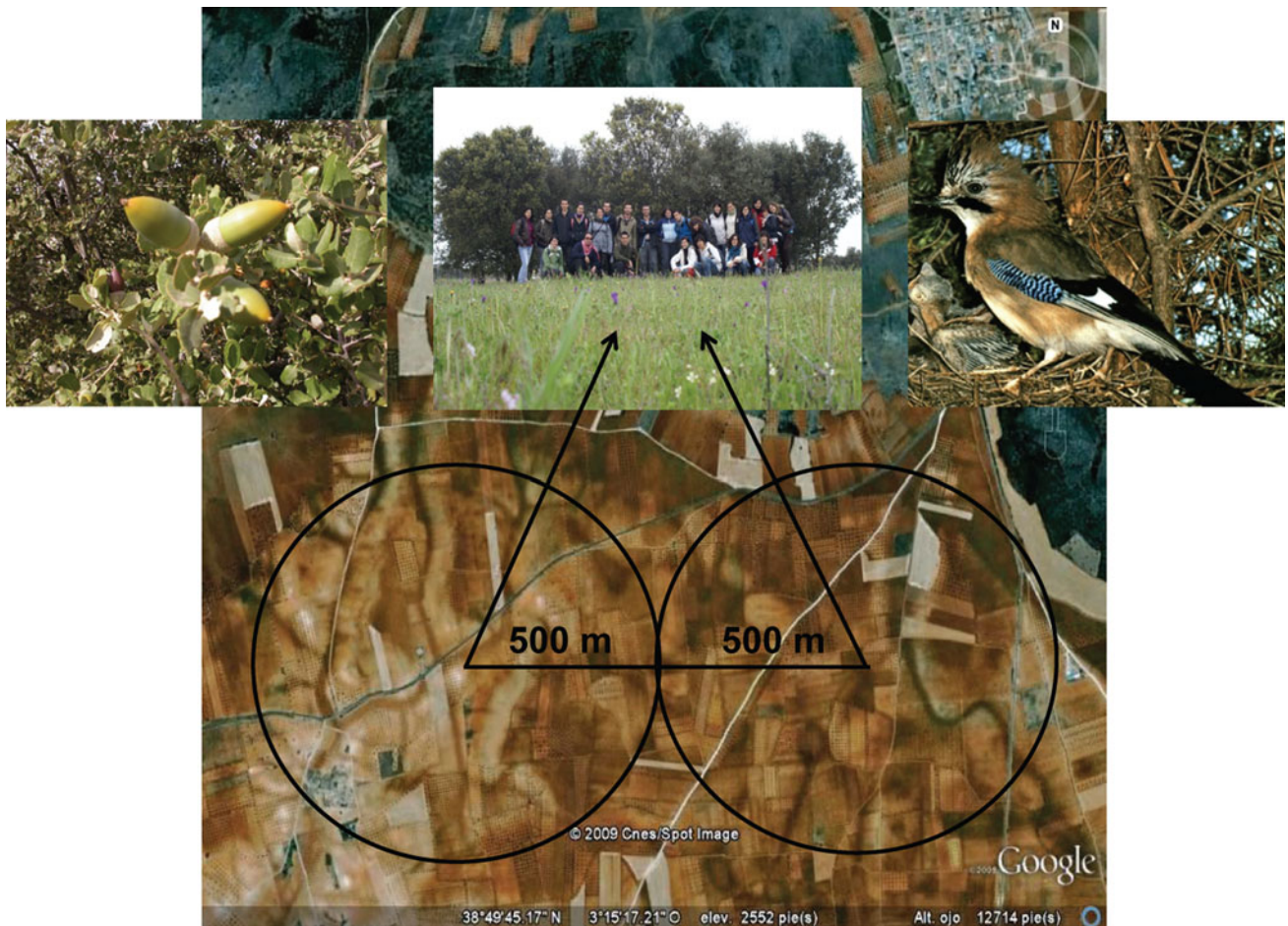
Figure 3. Simulation of the large area (ca. 1.6 km 2 ) that could potentially receive acorn rain following European jay dispersal from two introduced woodland islets (as shown in the upper photograph) or living fences 1 km apart from each other in a deforested agricultural landscape located in central Spain. The reported figure derives from an estimated dispersion distance of 500 m from each woodland islet or living fence (Purves and others 2007). Without the introduction of these elements, acorn rain and subsequently oak regeneration would not occur because native vegetation has been virtually extirpated in vast areas of this region.

to a degraded dispersal infrastructure is equally important in explaining plant diversity losses as habitat quality, and called for new measures to restore the dispersal infrastructure across entire regions.