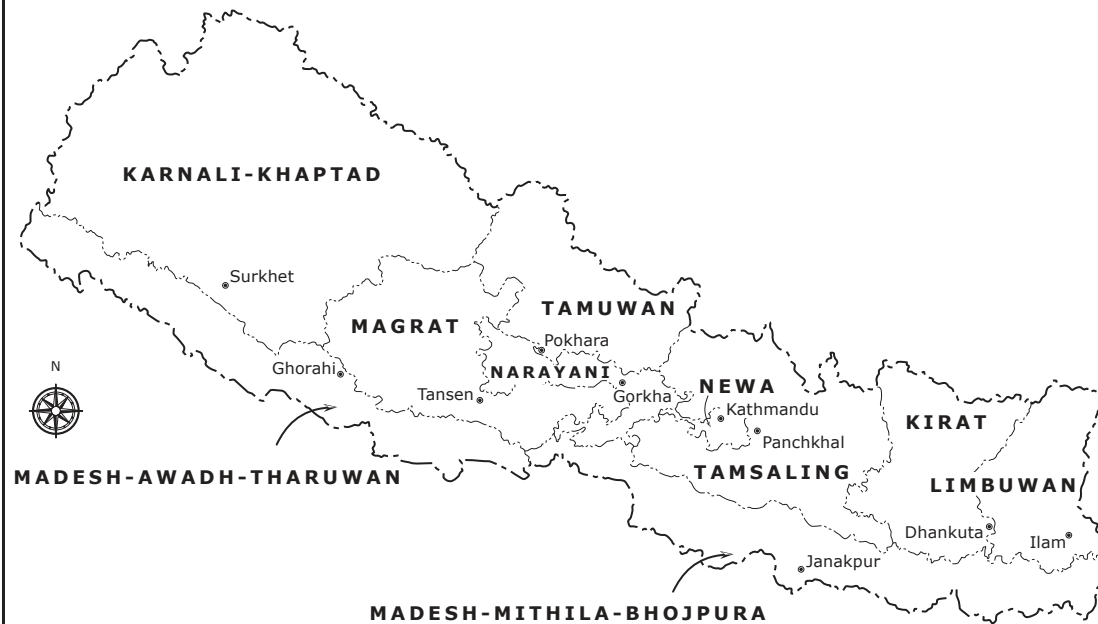
6 state model as proposed by the dissenting members of the High-Level State Restructuring Commission in January 2012