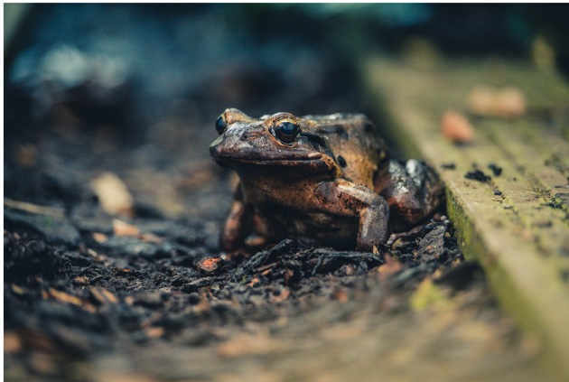
Figure 1 Critically endangered mountain chicken frog ( Leptodactylus fallax ), photo © Chester Zoo, 2022; photo shared with permission. Chytridiomycosis, volcanic eruptions and habitat loss have resulted in a catastrophic decline in mountain chicken frog numbers, with less than 150 mature individuals now surviving (IUCN SSC Amphibian Specialist Group 2017). Fortunately, somatic tissue samples have been cryopreserved in living biobanks, and with poor ex situ breeding success, aART may be an additional conservation tool to prevent this species from going extinct.

conservation opportunities for others (Hobbs et al. 2019). If cryobanking is to be an effective and efficient biodiversity conservation tool, then it is important that the way in which we select and prioritise species for storage follows a clear, coordinated and transparent methodology (CPSG 2016, Mooney 2021).